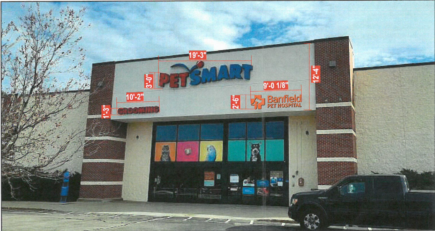
PROPOSED FRONT ELEVATION SCALE: 3/32"=1'-0"