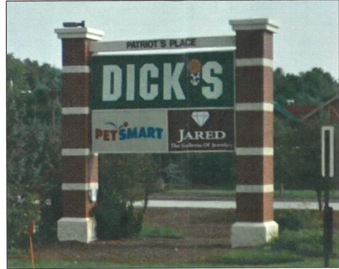
D/F MONUMNET AT LOUDON RD ENTRY NOT TO SCALE