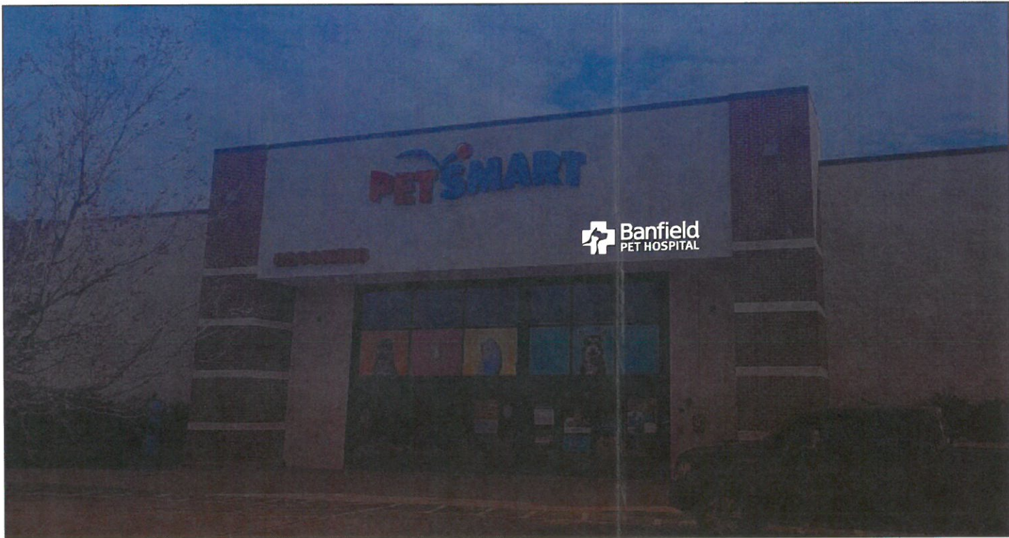
SIMULATED NIGHTTIME VIEW SCALE: 3/32"=1'-0"

Petsmart Existing is 3' x 19'3" = 57.75 sf Grooming Existing 1'3" x 10'2" = 12.7 sf Site Proposed is 92.95