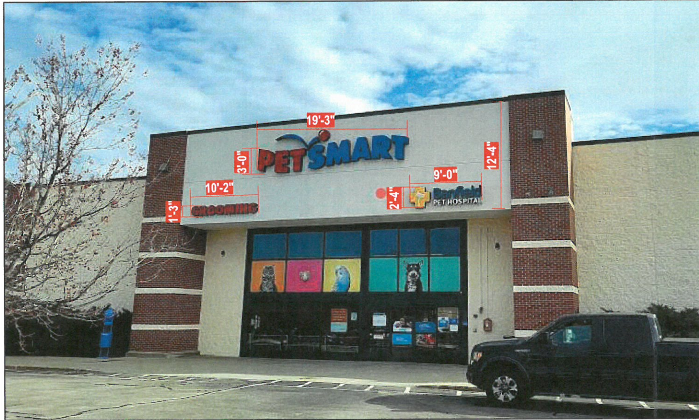
EXISTING FRONT ELEVATION SCALE: 3/32"=1'-0"