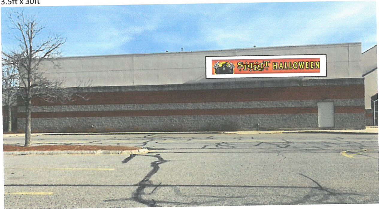
2020 Spirit Halloween Concord, NH Sears Building Steeplegate Mall Auto Center 3.5ft x 30ft