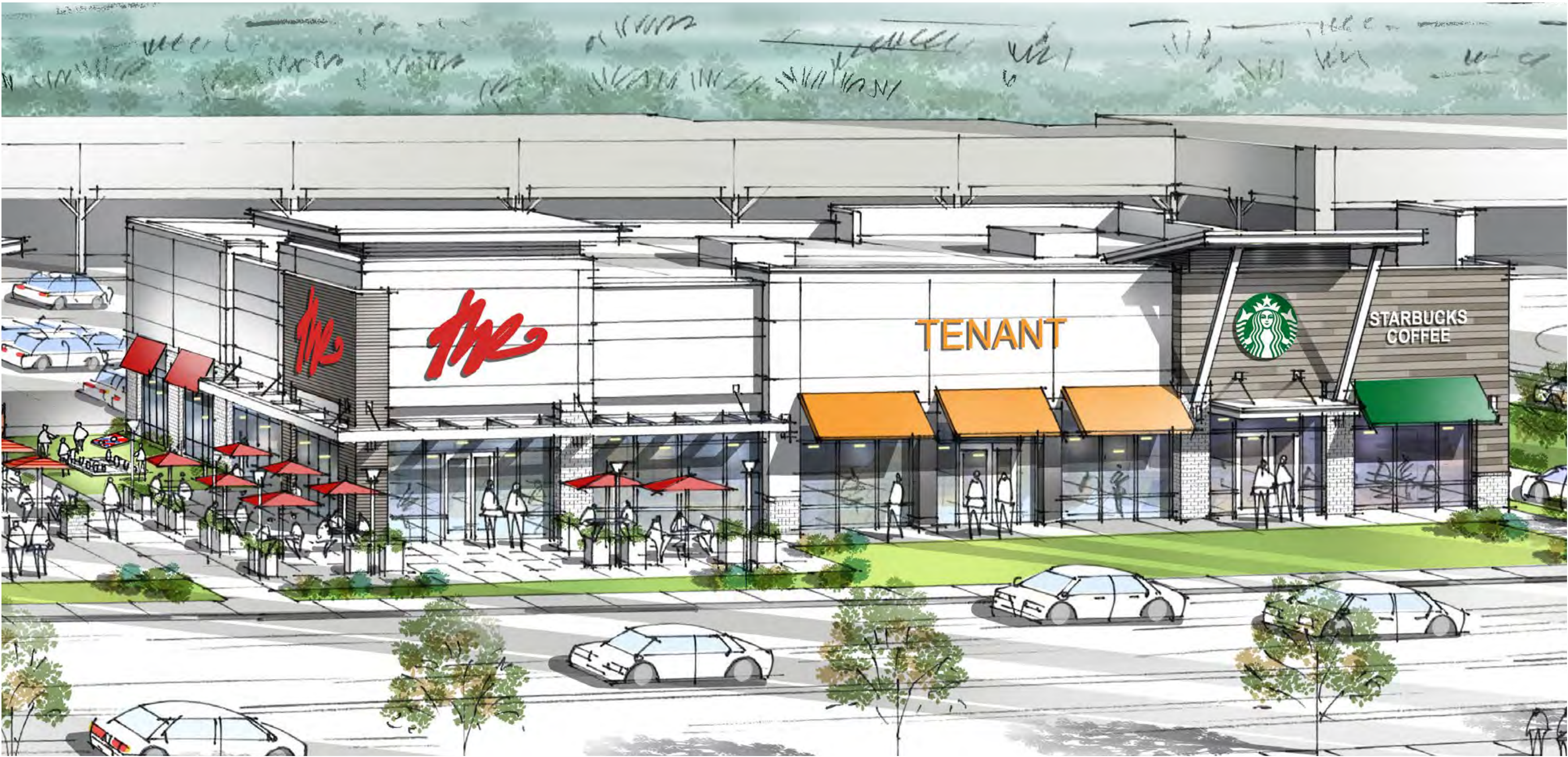
OUTPARCEL #2 AERIAL VIEW - LOOKING FROM STORRS STREET