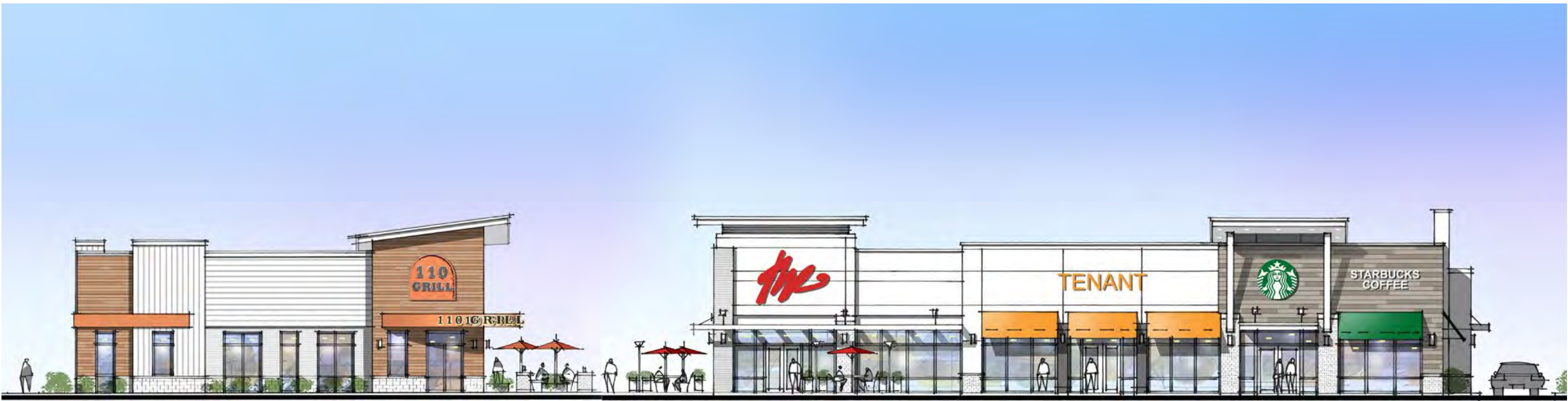
OVERALL WEST ELEVATION - FACING STORRS STREET