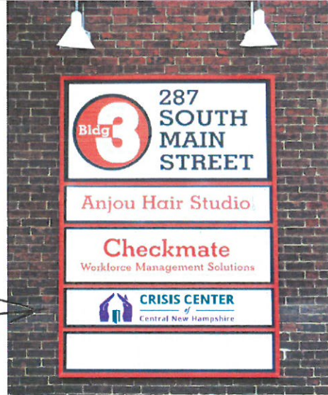
8" x 56" Tenant Panel