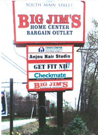
8" x 56" Tenant Panel