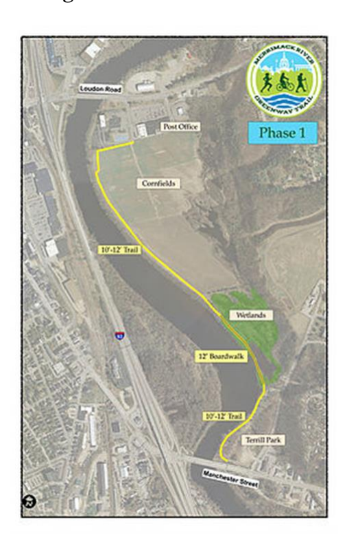
Yellow = proposed route of Greenway Trail