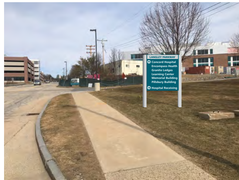
PROPOSED LOCATION. APPROXIMATE SIZE.

POST & PANEL DIRECTIONAL SIGN; SCALE 1:16; 18SF SINGLE FACE, NON ILLUMINATED SIGN FACE: PAINTED C-H TEAL POSTS: PAINTED SILVER COPY: WHITE REFLECTIVE