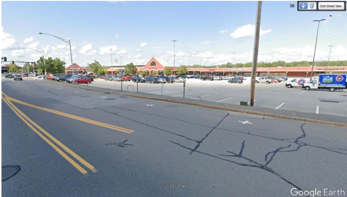
3. Google Earth Image-3, Looking northeast across Storrs Street toward proposed project area.