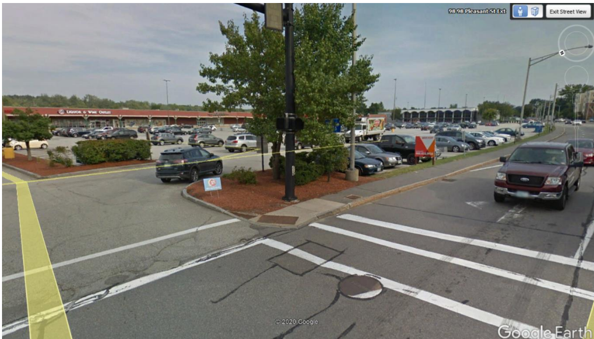
2. Google Earth Image-2, Existing main entrance to plaza looking southeast toward proposed project area.