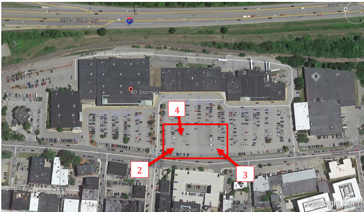
1. Google Earth Image-1, Aerial of existing site (site outlined in red).