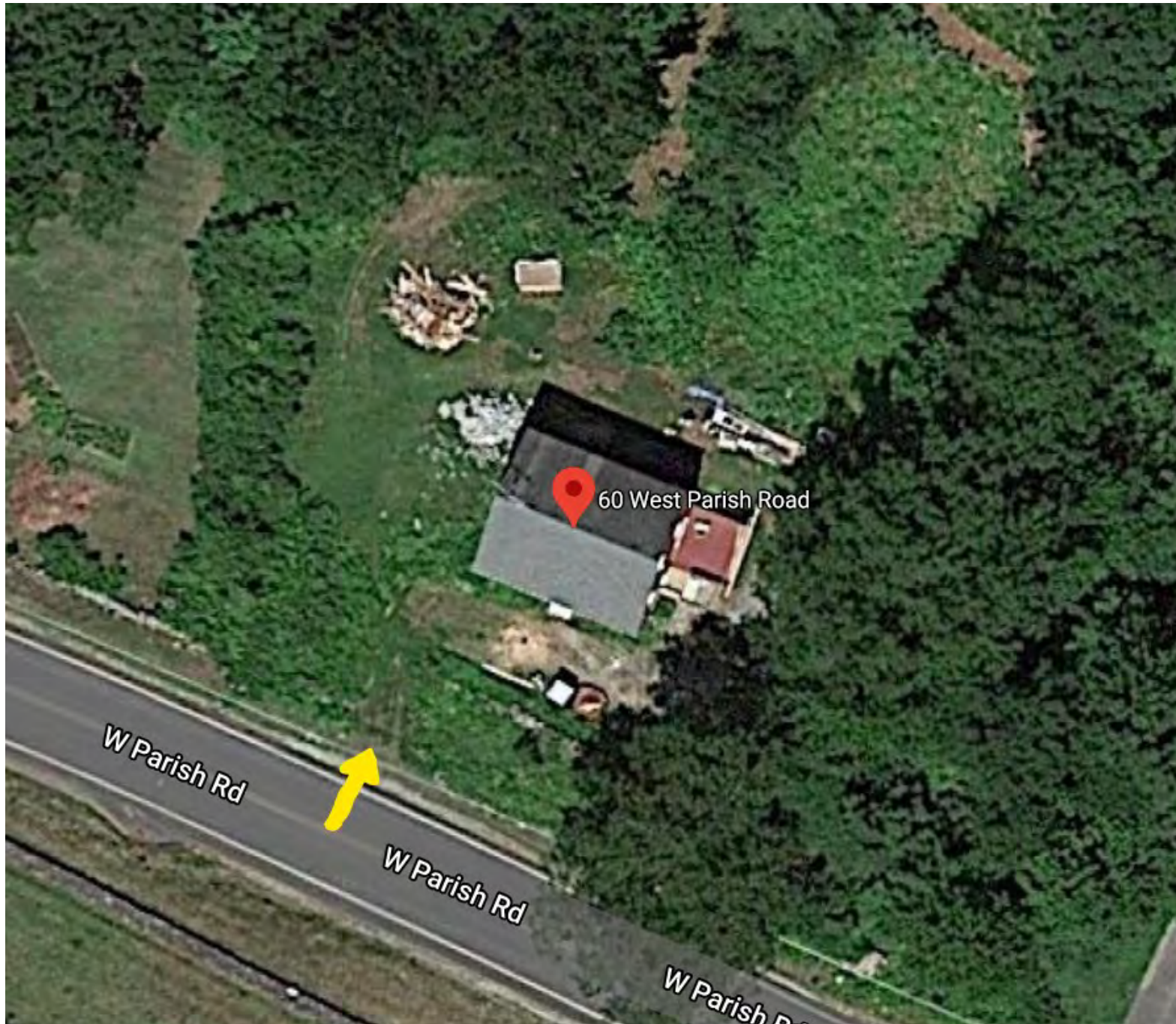
You can see where on the left side of the house (yellow arrow) where vehicles have parked on in the past.