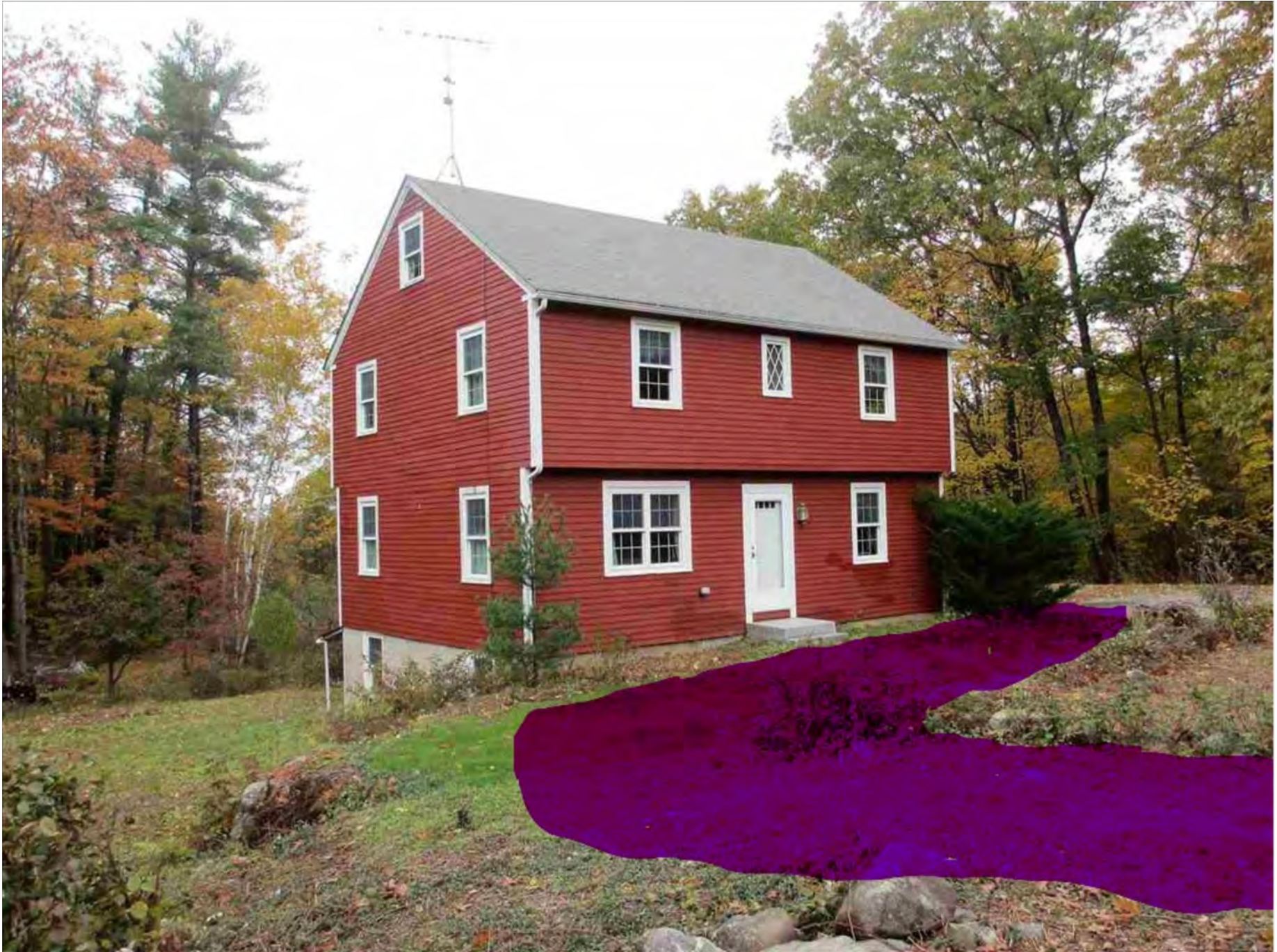
Proposed Driveway addition in Purple– 12 feet wide