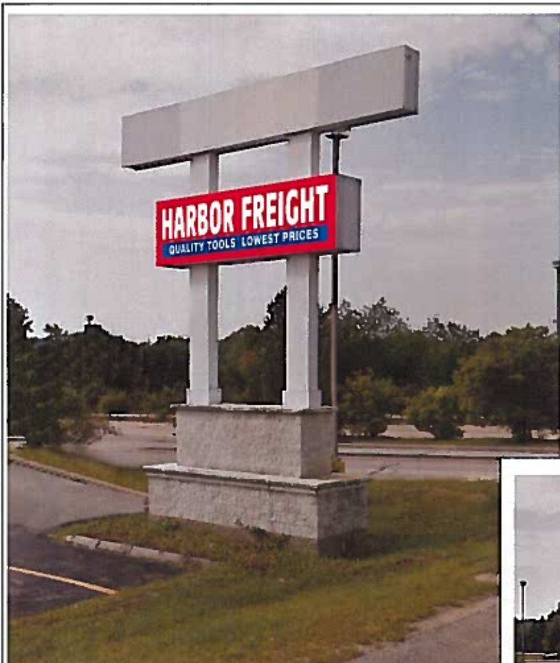
PYLON ELEVATION - Sign Type (B)(QTY:2) Replacement Flex Faces - Mounted In Existing Cab Scale: NA