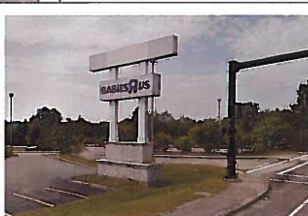
EXISTING CONDITIONS NTS