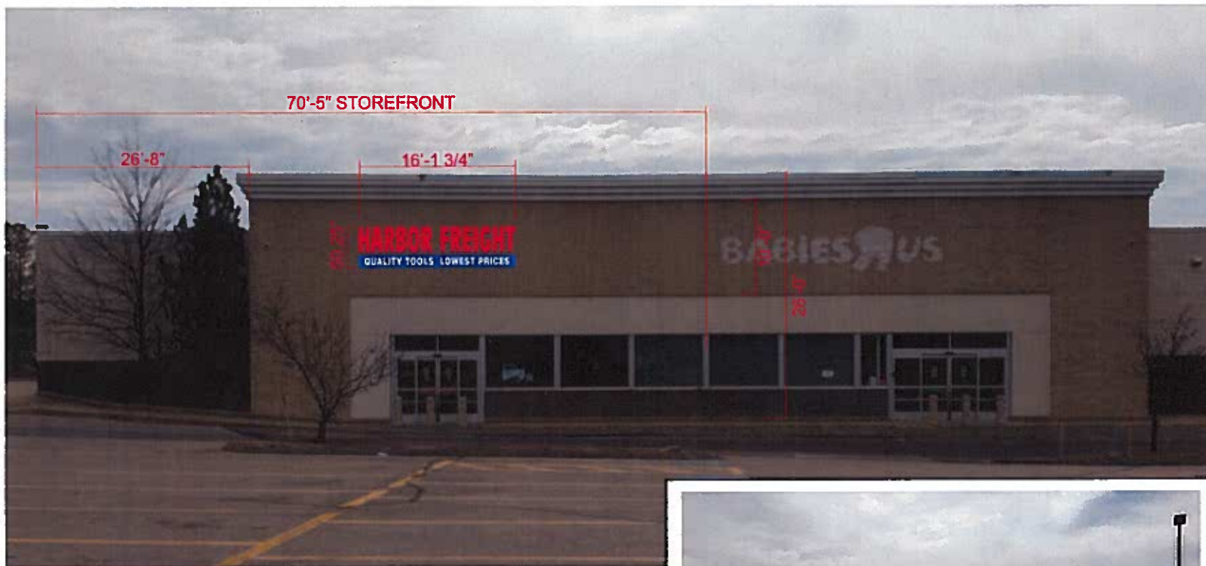
FRONT ELEVATION - Sign Type (A.)(QTY:1) Channel Letters - Remote Mount With Sub Cabinet Scale:3/32" = 1'-0" (67.6 SQFT)