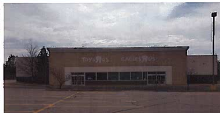
EXISTING CONDITIONS NTS