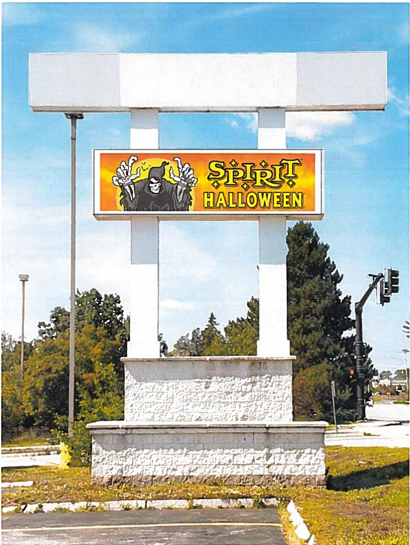
Proposed Spirit Halloween Pylon Sign 5'H x 16'W (same as last year) to cover existing Babies R Us sign on existing pylon #61072 Concord, NH