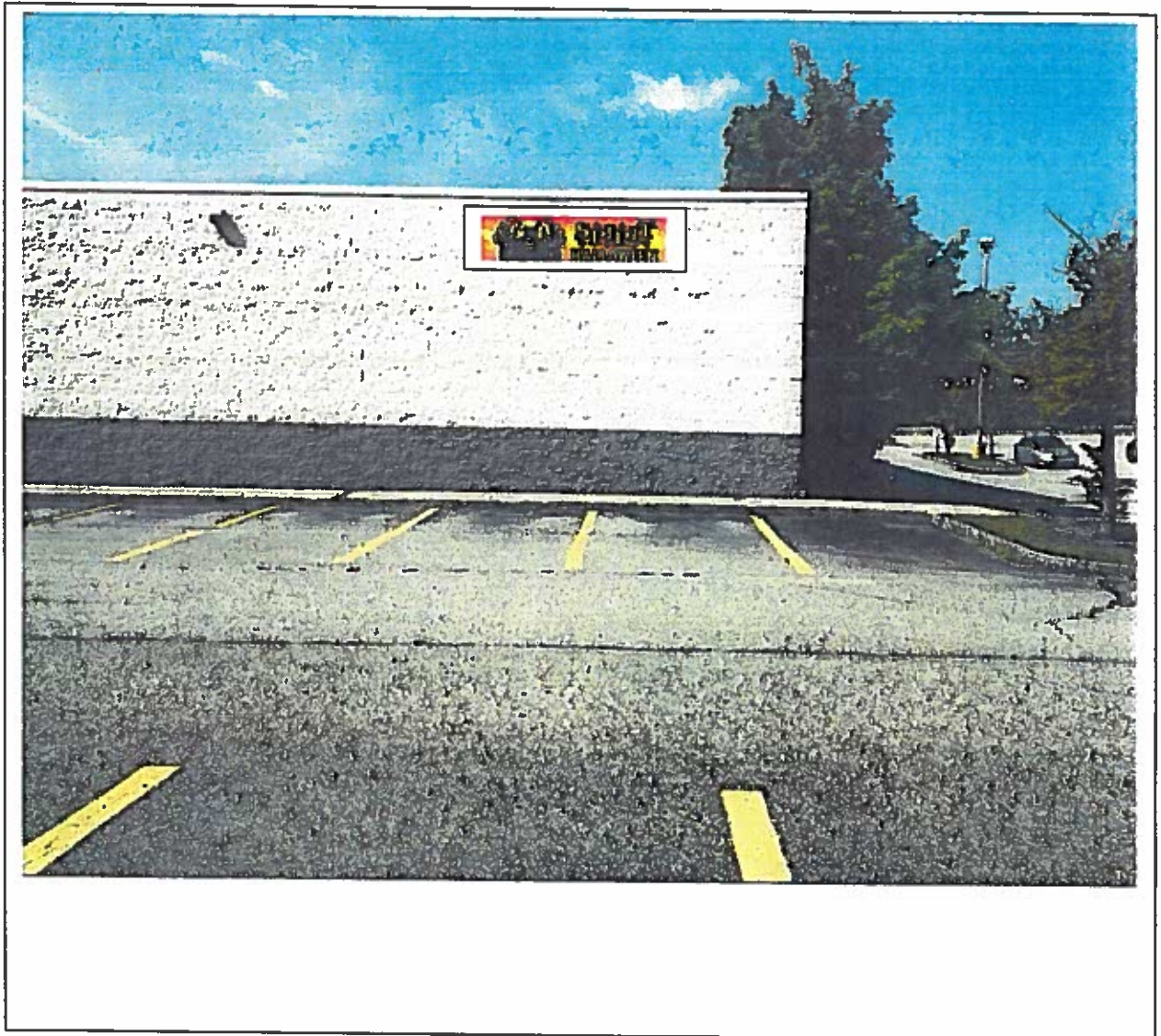
Proposed Spirit Halloween Sign 2'H x 12'W (24 Sq Ft)