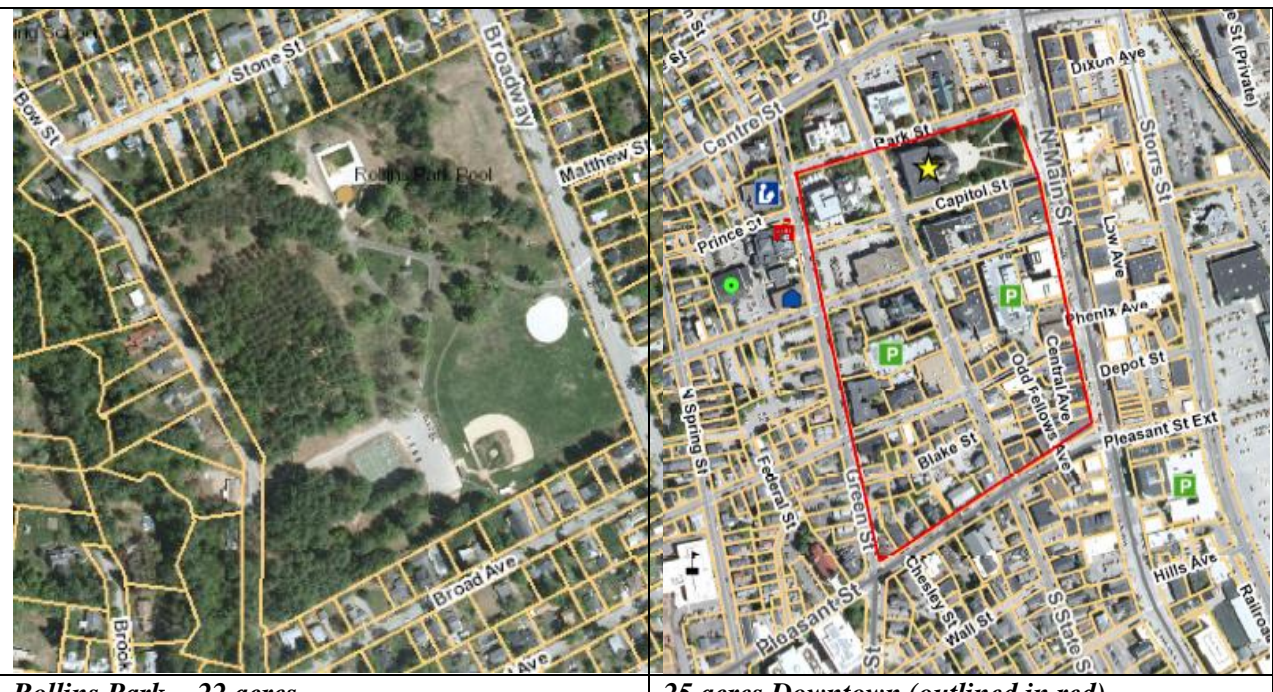
Rollins Park - 22 acres

In order to provide some understanding of the scale of what is proposed, below are images of known, developed areas within the City that encompass approximately 25 acres.