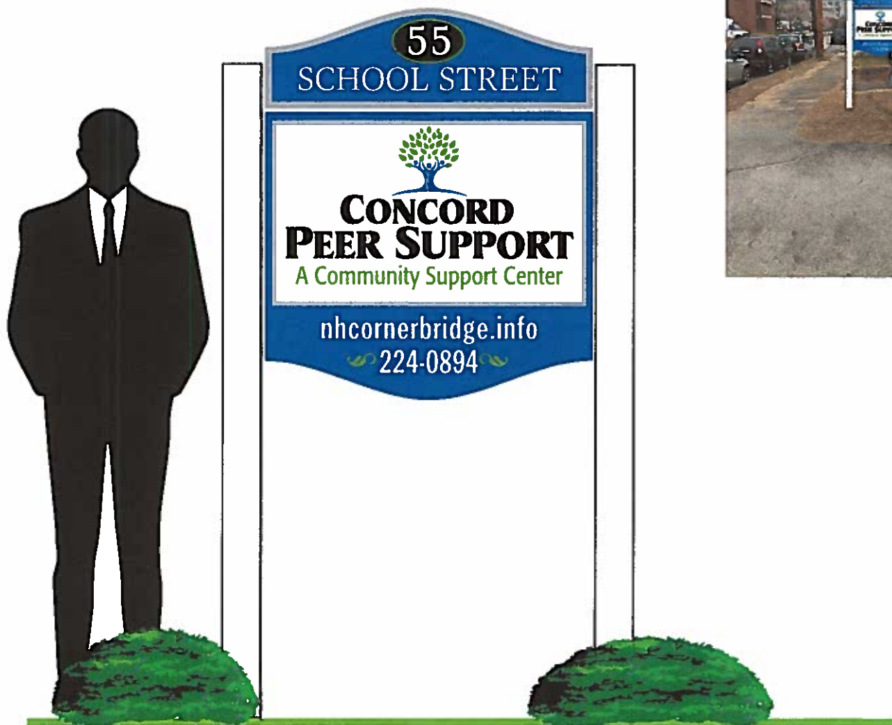
DOUBLE SIDED, 32"X36" COMPOSITE ALUMINUM SIGN, MOUNTED ONTO (2) 4'SQ. ALUM. POSTS