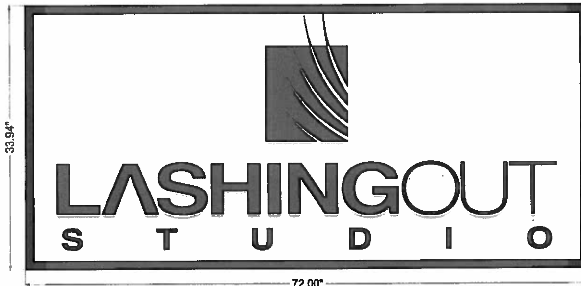
Single Sided Wall Sign 17 sqft