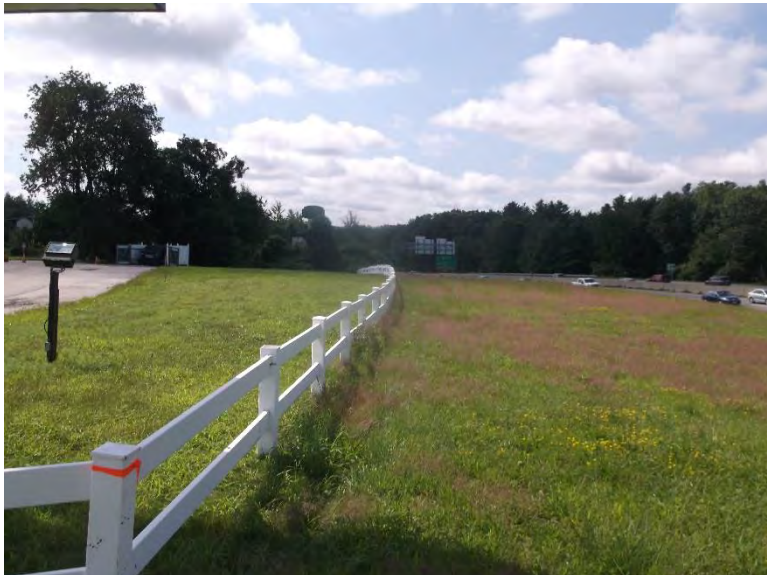
Existing fencing and grass area adjacent to F.E. Everett Turnpike ROW, looking south along I-93.