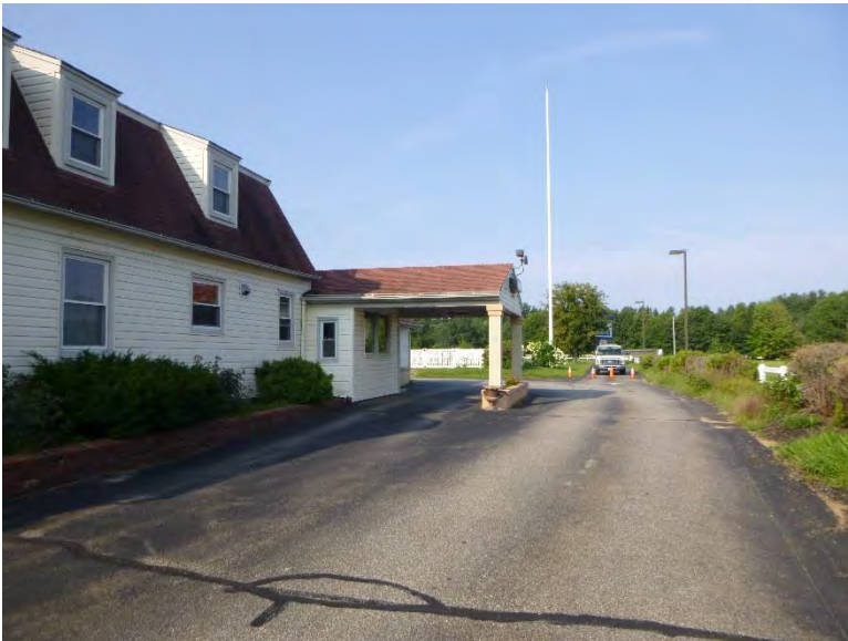
Existing office building and internal access drive, looking west towards I-93.