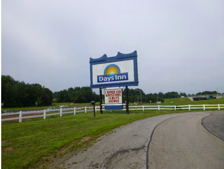
Existing Days Inn Signage, located along western fence line, looking north towards I-93.