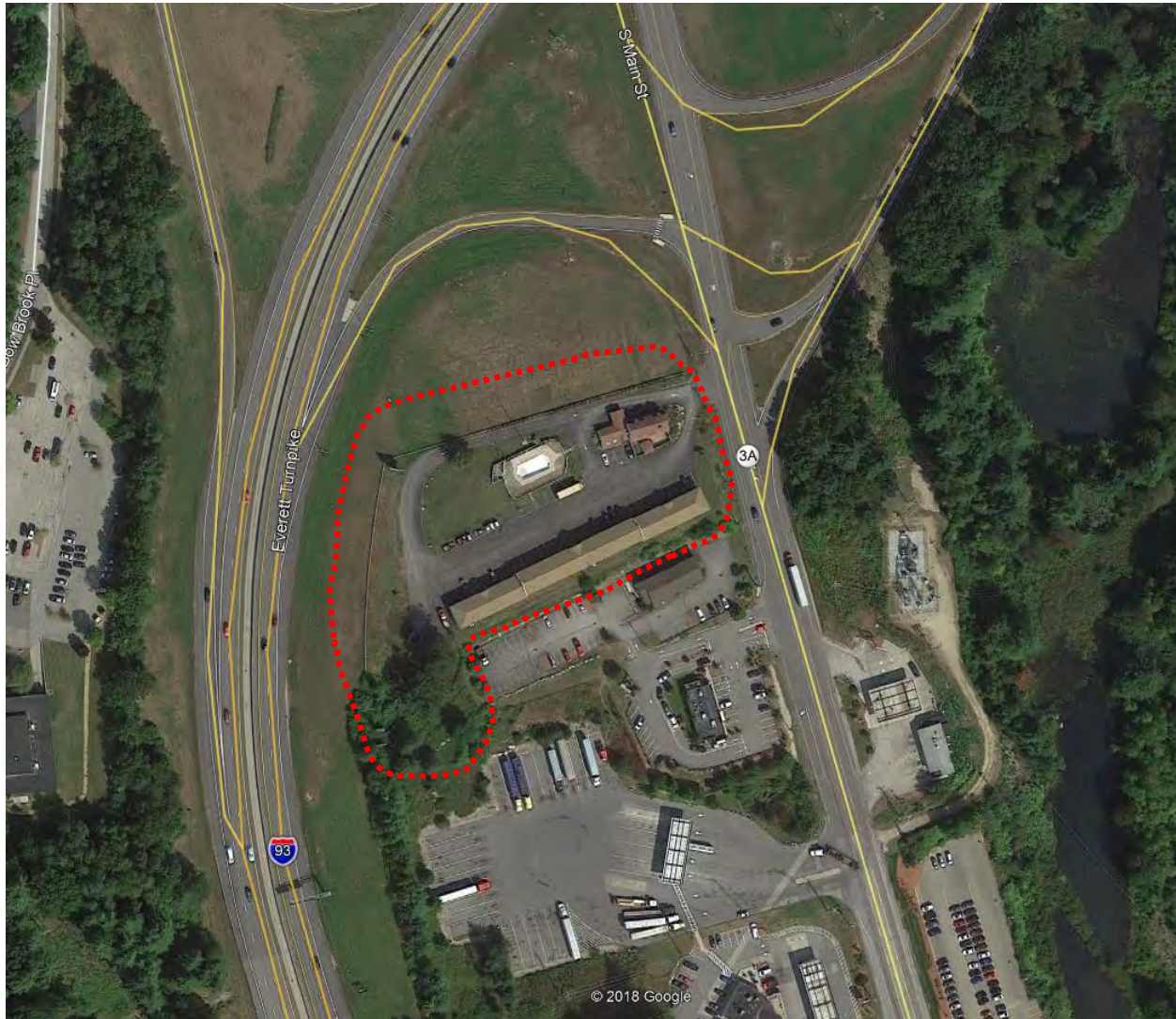
Aerial Imagery of the proposed Days Inn Redevelopment (Map 1 Block 2 Lot 3) and proposed area of work (seen in red).

Days Inn Redevelopment 406 South Main Street Concord, NH 03301