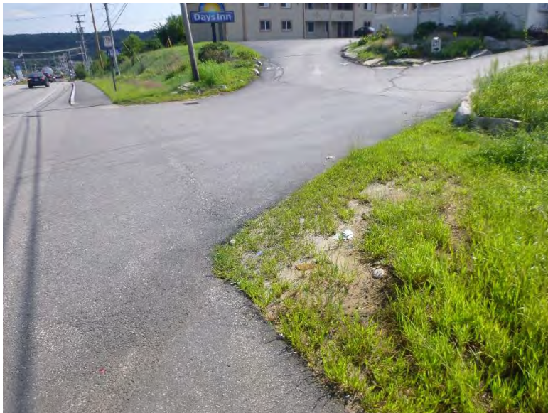
Existing paved access drive from South Main Street, looking south towards the Days Inn.