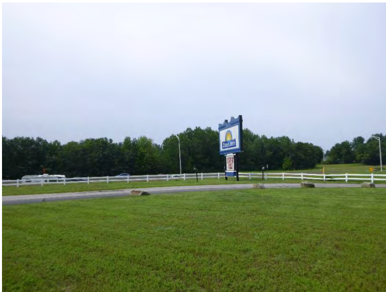
Existing lawn area and Days Inn Signage, looking west towards I-93.