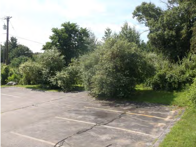
Existing paved lower parking (Lot 1-2-2) and area of proposed parking expansion (Lot 1-2-1), looking west.