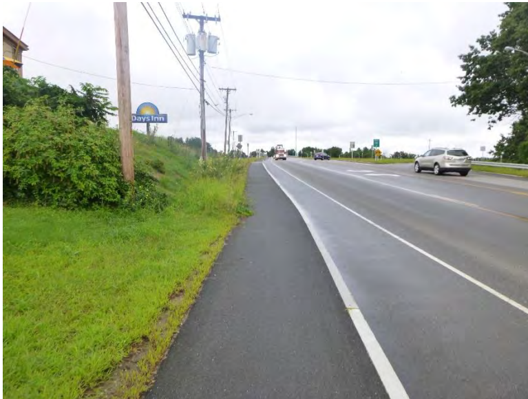
Existing paved sidewalk along South Main Street, looking north along South Main Street.