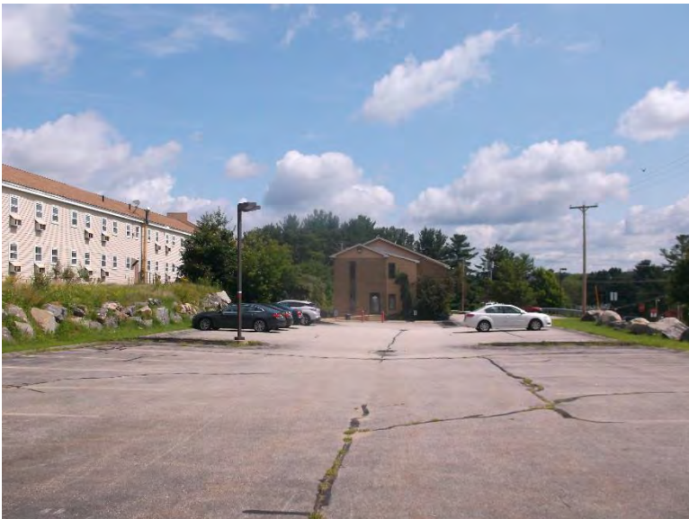
Existing paved lower parking (Lot 1-2-2), looking east.