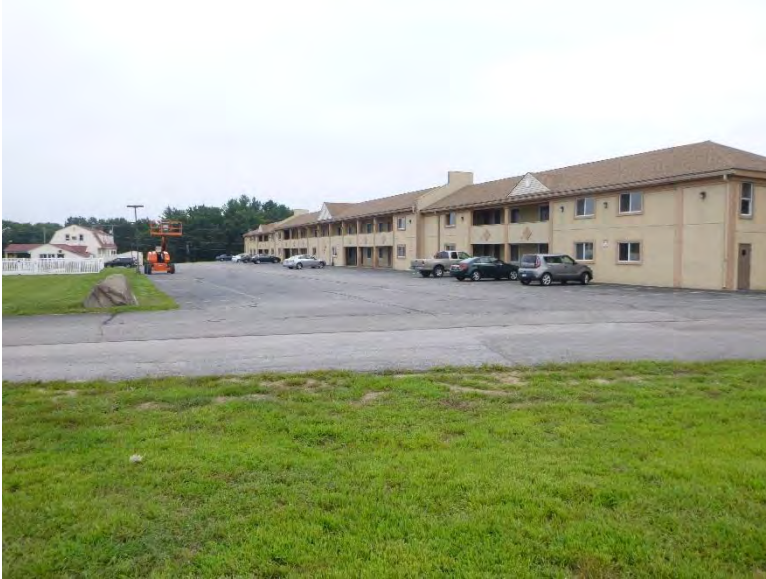
Existing Days Inn Hotel and paved parking area, looking east towards South Main Street.