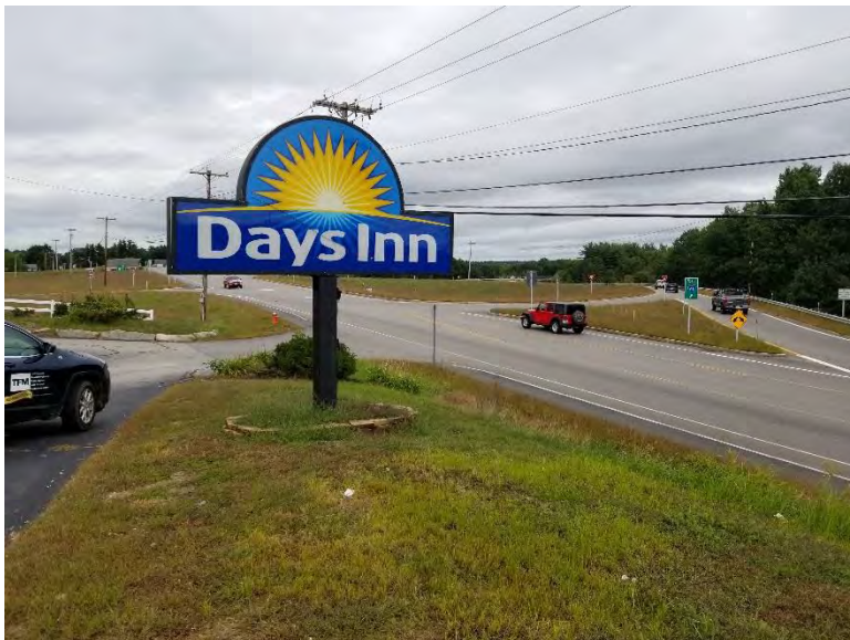
Existing Days Inn Signage adjacent to South Main Street, looking north towards I-93.