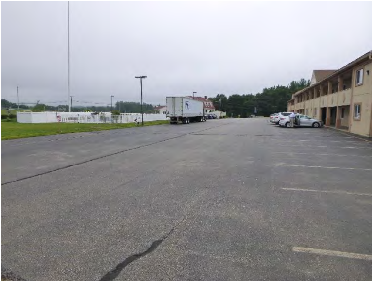
Existing paved parking area, looking east towards South Main Street.