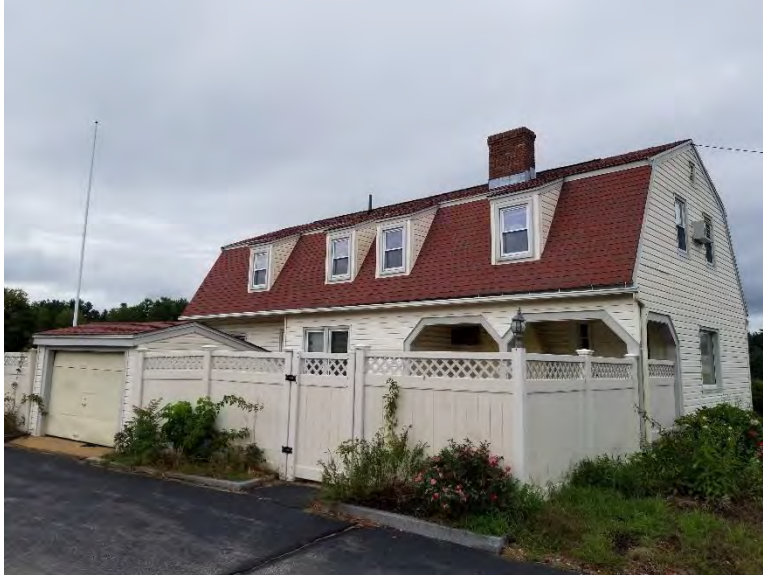
Existing office building, looking north from Days Inn Hotel.