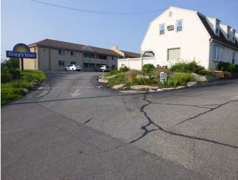
Existing paved access drive, hotel and office building, looking south towards the Days Inn.