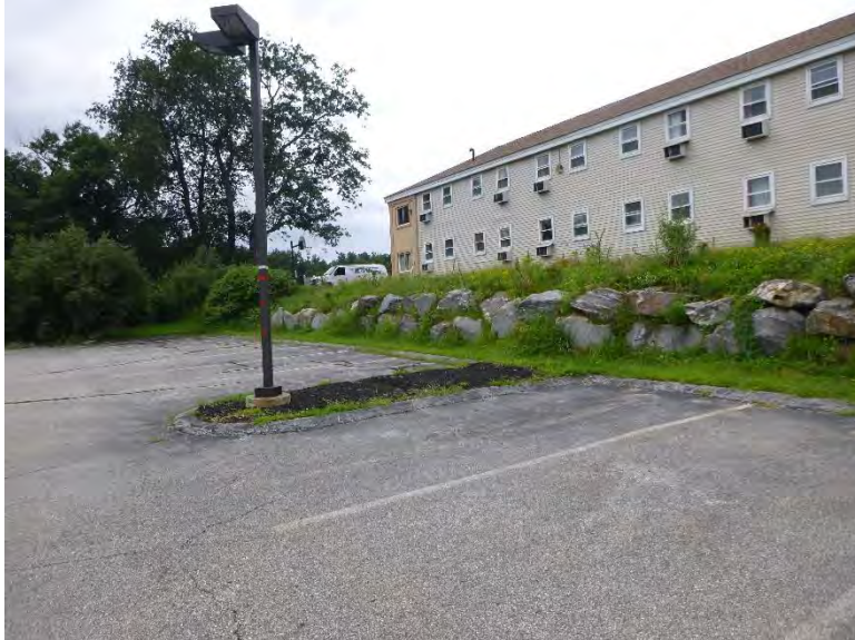
Existing Days Inn Hotel, retaining wall and adjacent lower paved parking area, looking northeast toward Hotel from Lot 1-2-2.