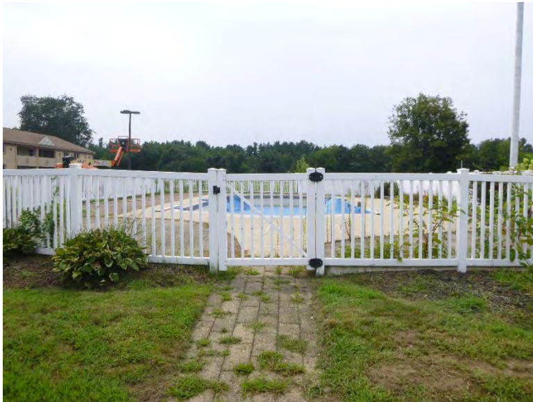
Existing swimming pool and enclosure, looking west towards I-93.