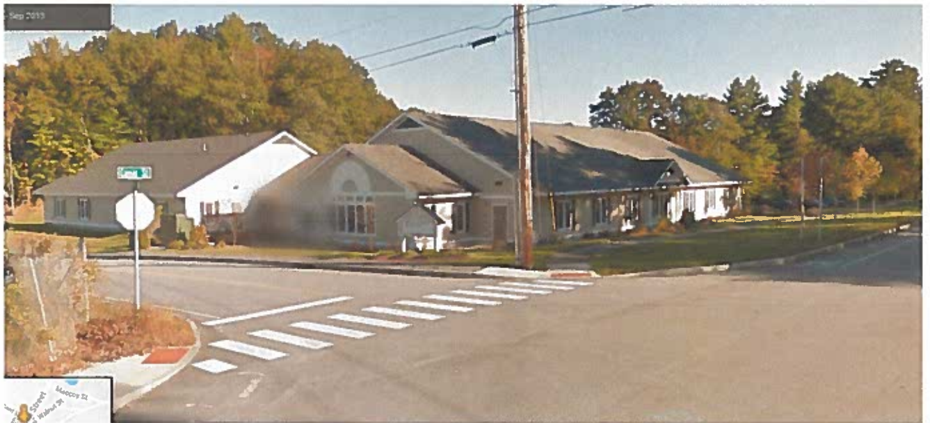
Building view at intersection of Canal and Crescent Streets