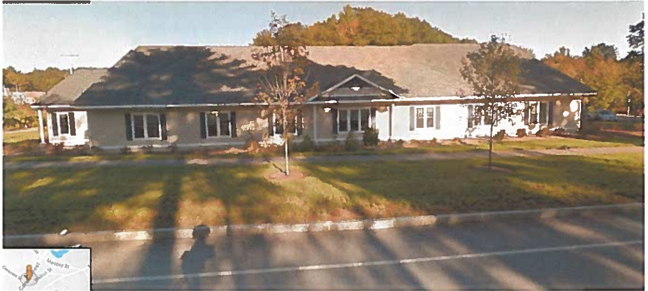
Building view from Canal Street