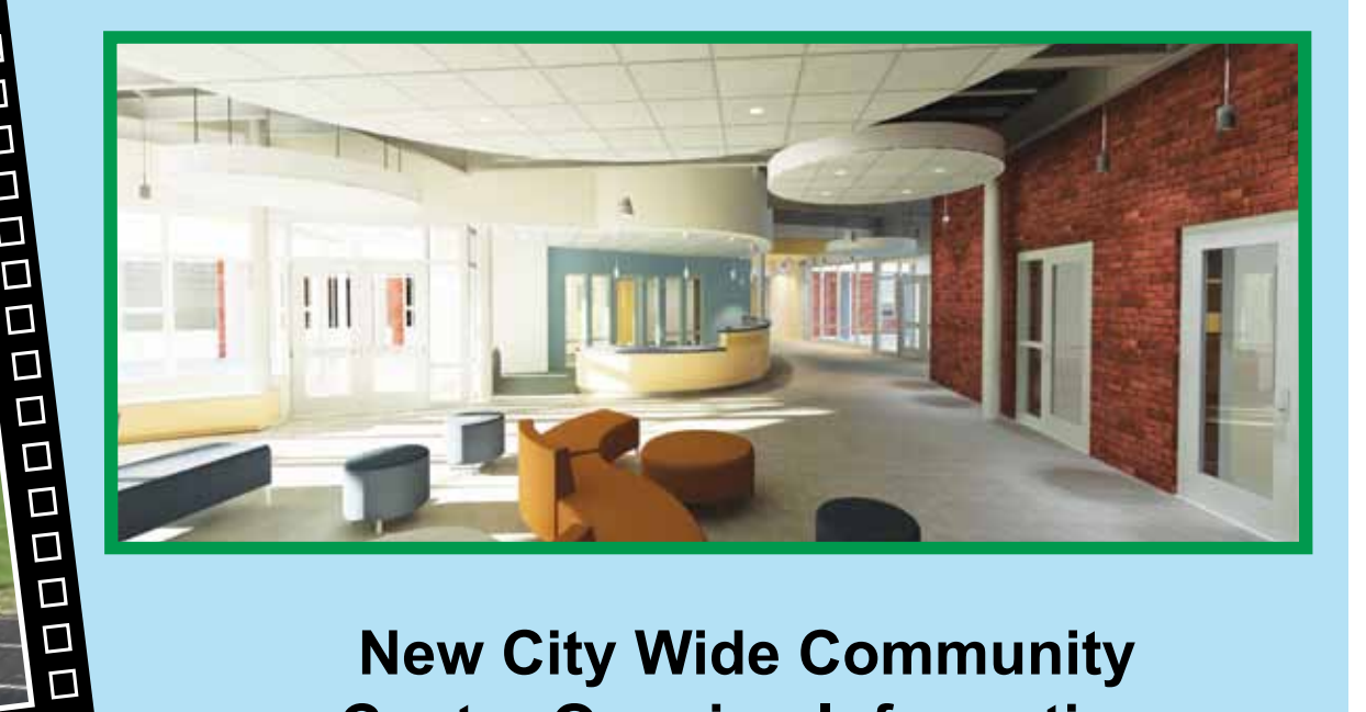
New City Wide Community Center Opening Information

www.concordparksandrec.com • www.facebook.com/concordparknrecdept