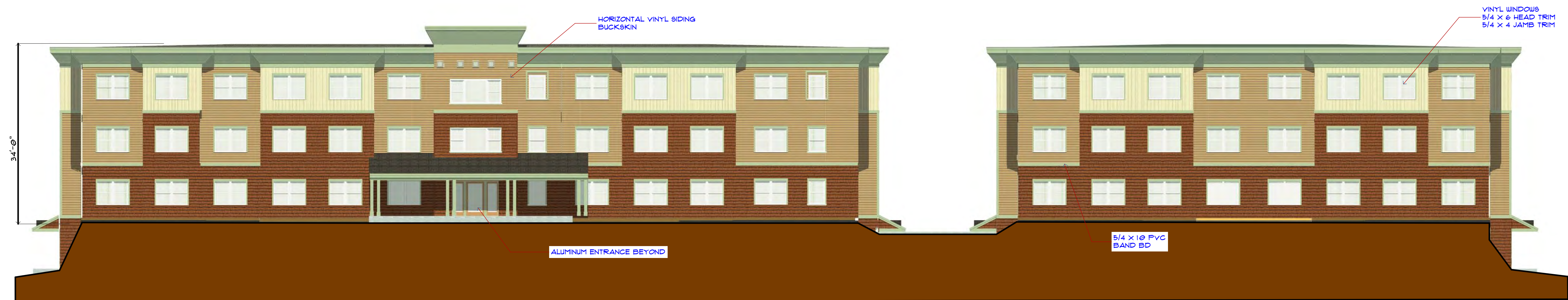
SE SOUTHEAST ELEVATION (2)