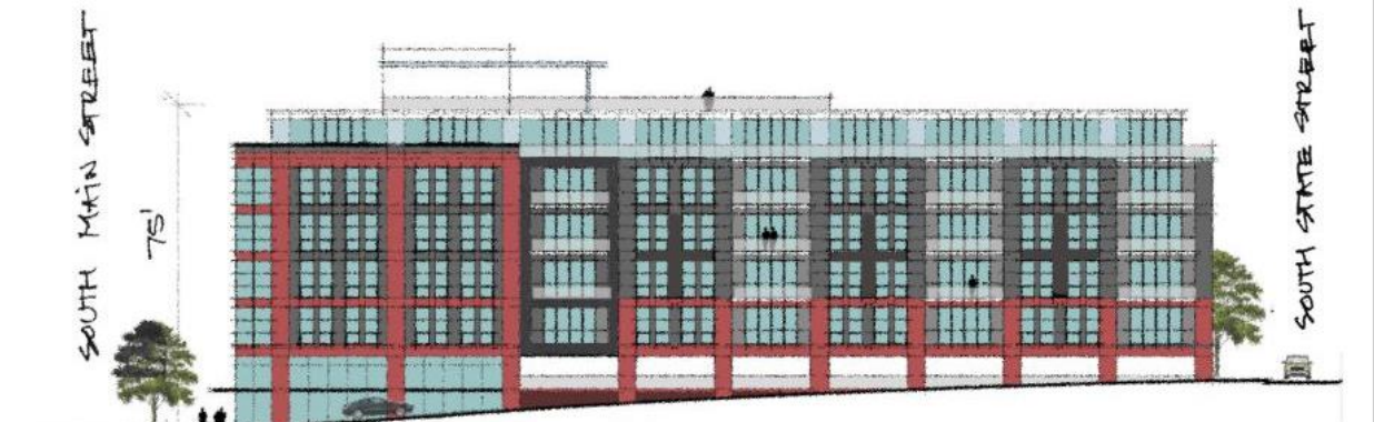
Fayette Street Elevation