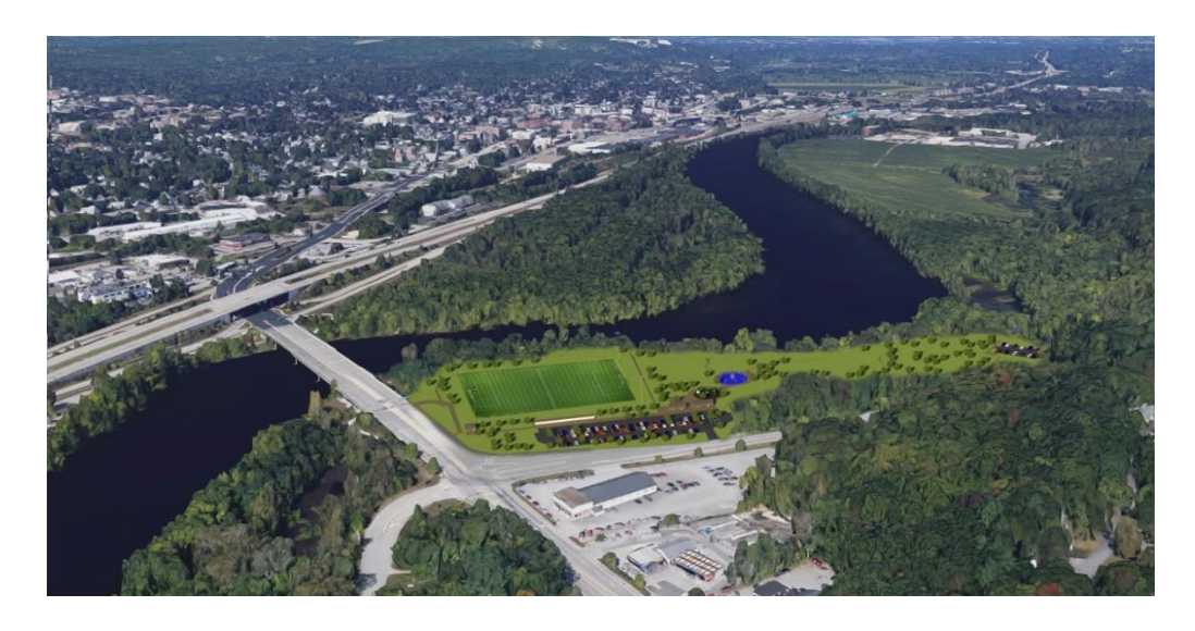
Aerial View of the new Terrill Park

Over the next several months VHB along with staff will be presenting the plan for review and permitting with both the City and the State agencies. It is anticipated final design documents along with required permits will be finalized by spring 2018.