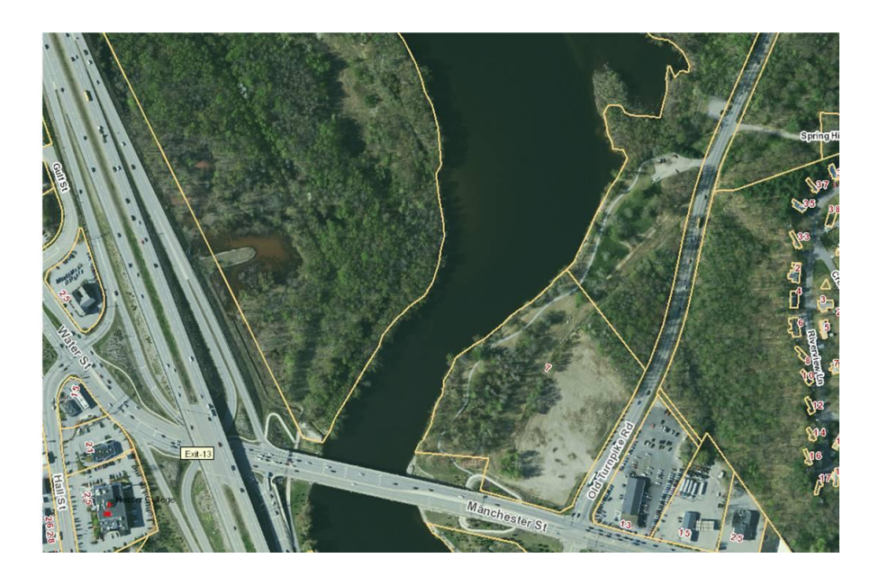
Close up of Terrill Park as it is today.