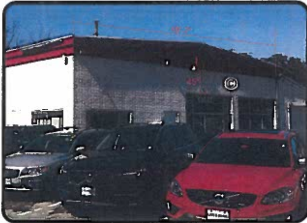
EXISTING - SIGN C