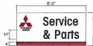
(C) FRONT VIEW @ SWS-S&P WALL SIGN Scale: 3/8" = 1' 18.74 SQ. FT

LOGOTYPE: CASOCRYL DAY / NIGHT ACRYLIC BACKS UP ROUTED SIGN FACE.