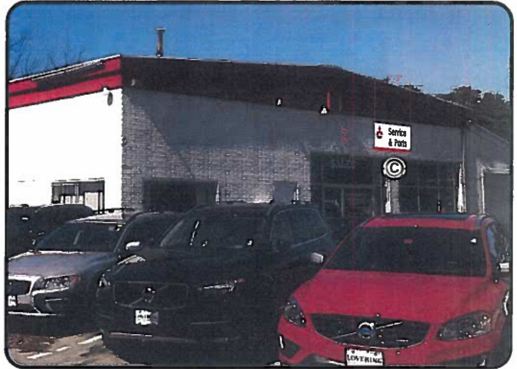
NEW- SIGN © G2 SWS-S&P WALL SIGN

Install G2 SWS-S&P Wall Sign. Internally Illuminated.