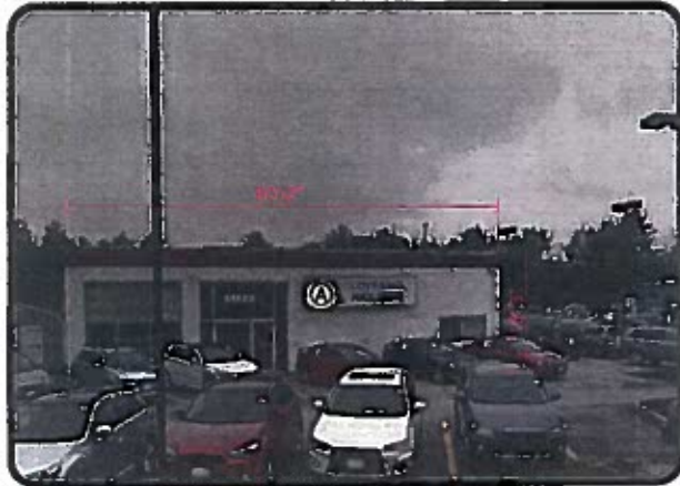
EXISTING - SIGN A