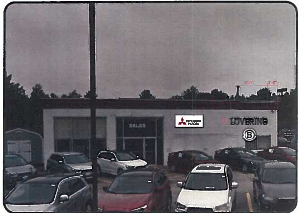
NEW- SIGN (B) DL20 DEALER LETTERS SIGN

Install DL20 Dealer Letters Sign. Internally Illuminated.