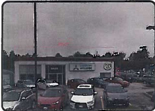
EXISTING - SIGN B