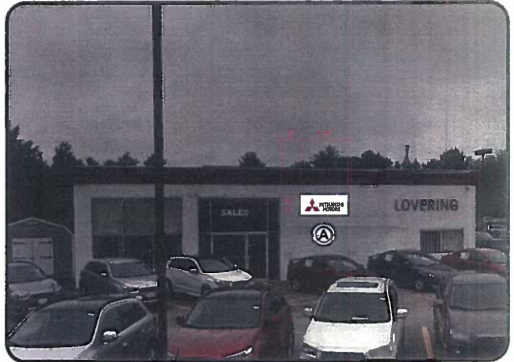
NEW- SIGN (A) W20H WALL SIGN

Remove Existing Cabinet Sign. Install W20H Wall Sign. Internally Illuminated.