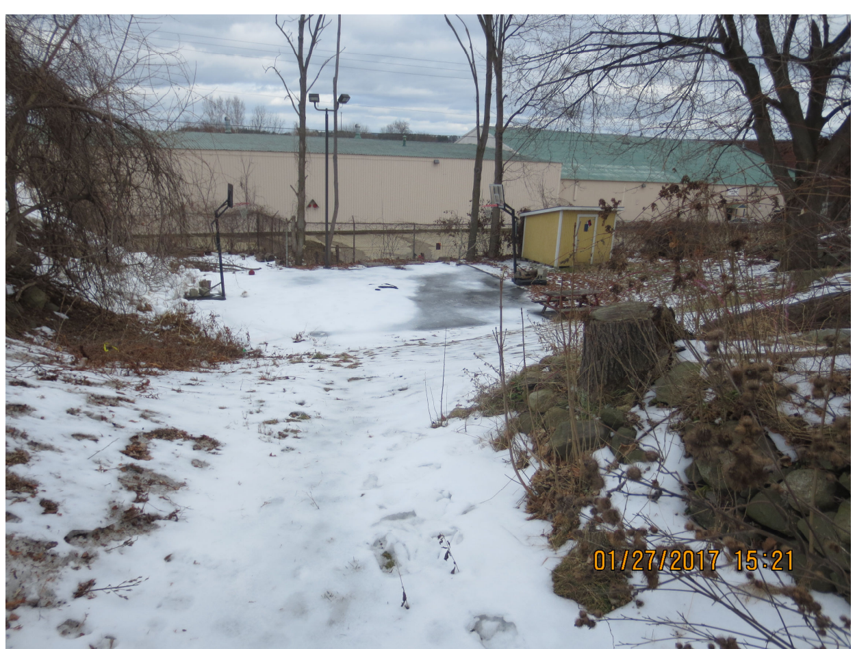
Figure 3 PROPOSED BLDG AREA - Ikng East