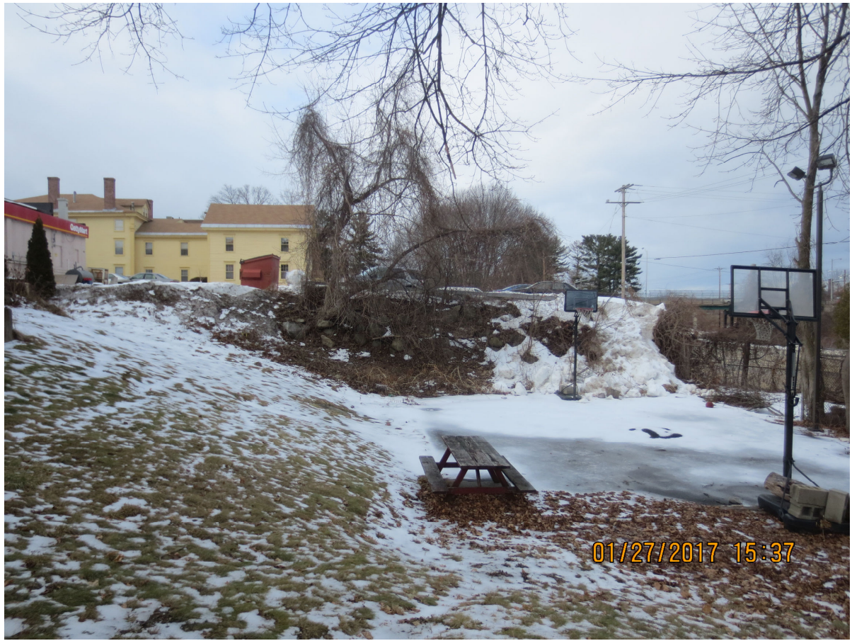
Figure 4 PROPOSED BLDG AREA - lkng North