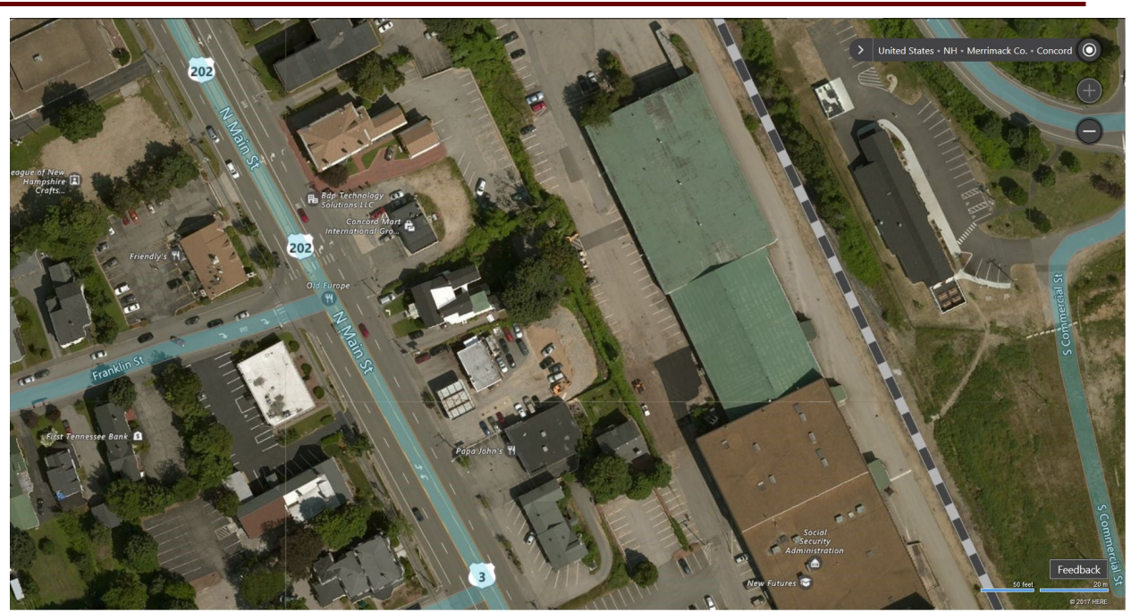
Figure 1 AIR PHOTO of CHRC LOT