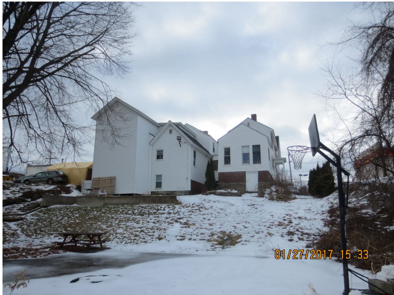
Figure 6 PROPOSED BLDG AREA - lkng West