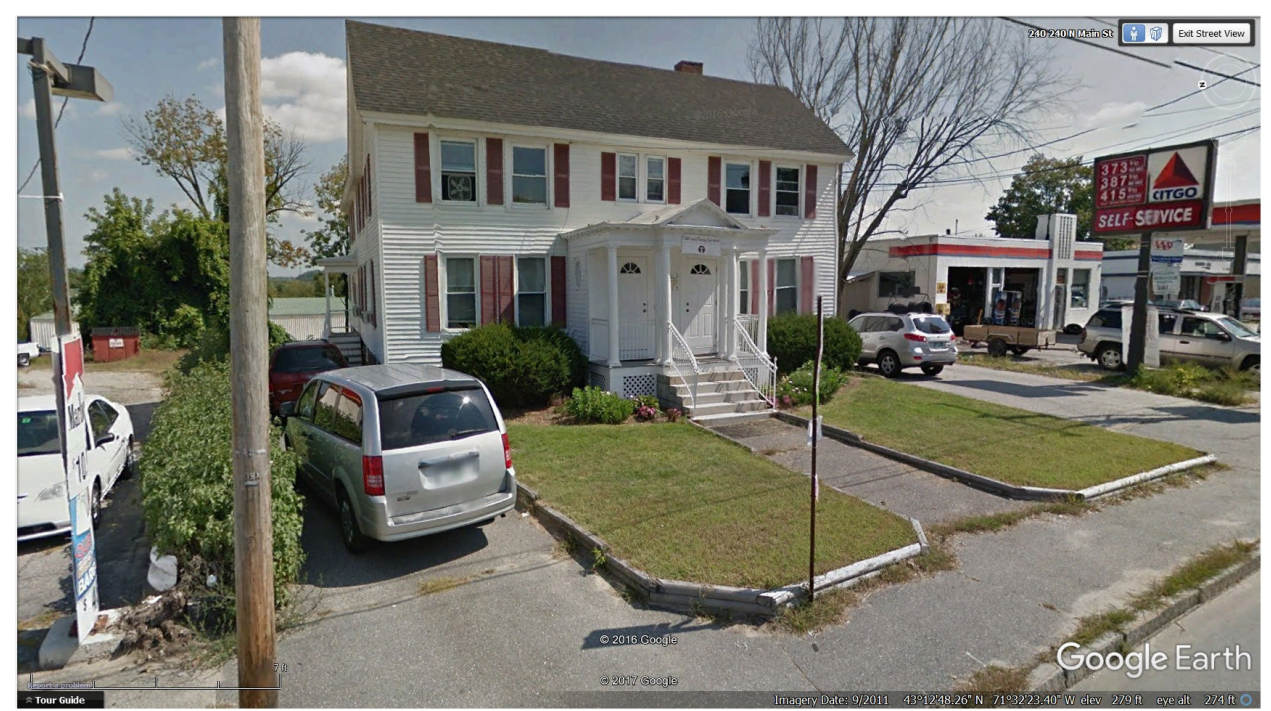
Figure 2 CHRC FRONT at N MAIN ST,