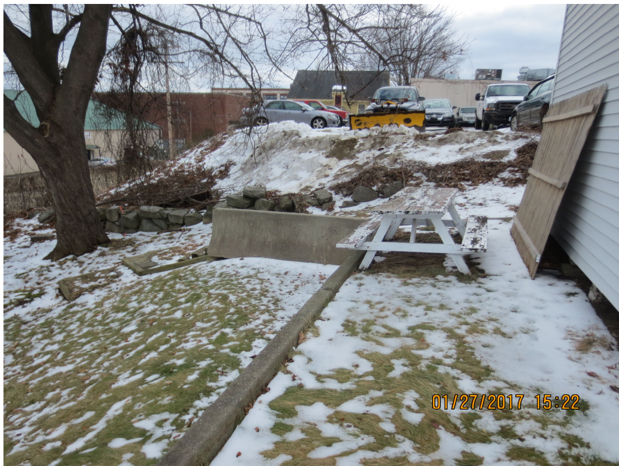
Figure 5 PROPOSED BLDG AREA - lkng South