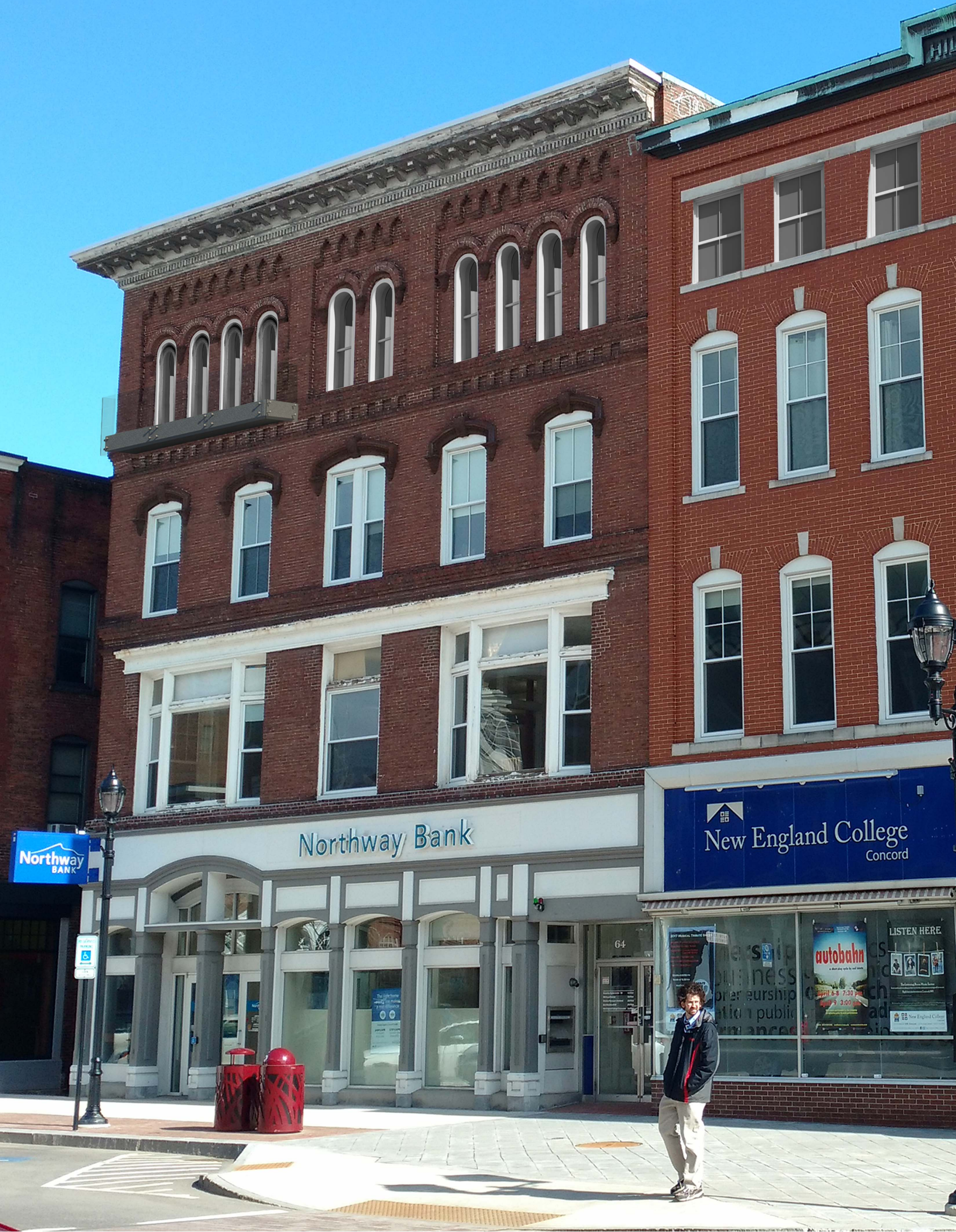
Main St Apartment Renovation 66 N. Main St Concord, NH 03301

REVISED SUBMISSION PER ADR RECOMMENDATION