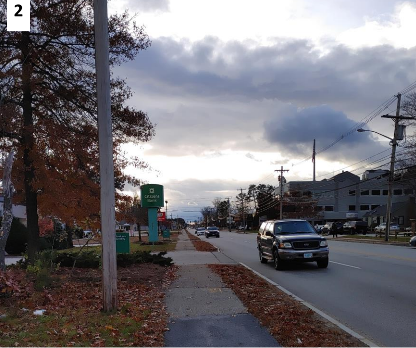
1 Citizens Bank