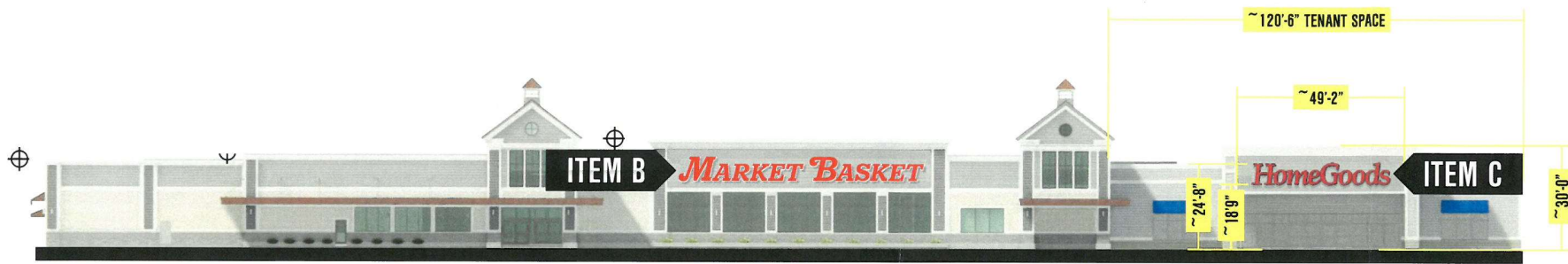
WEST ELEVATION SCALE: 1/32"=1'-0"