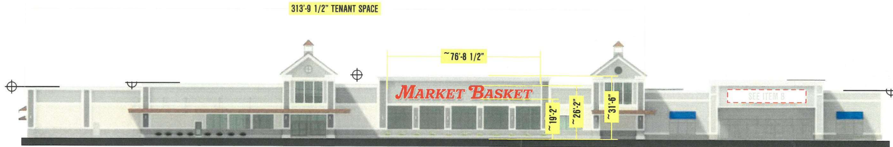
WEST ELEVATION SCALE: 1/32"=1'-0"