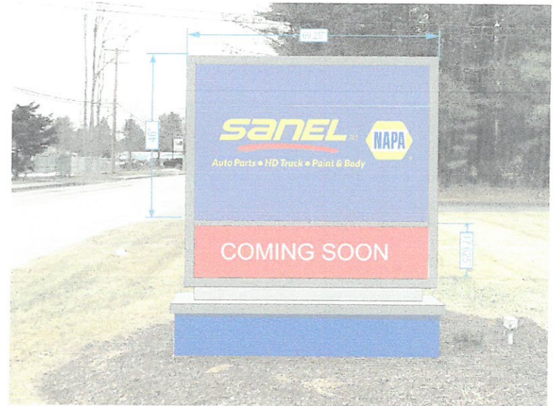
PROPOSED SIGNAGE - TEMPORARY