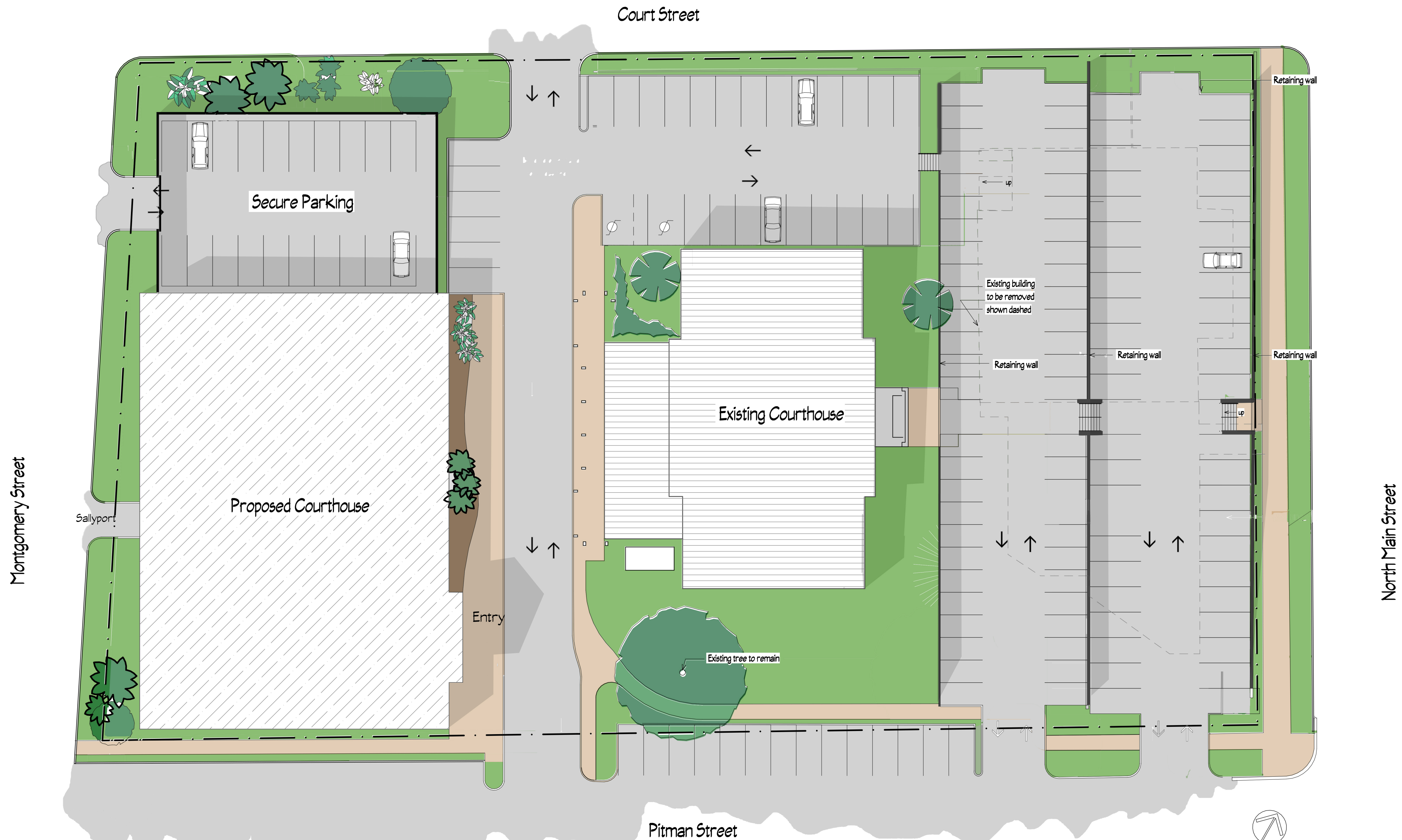
1 P022316-1 Proposed Site Plan 162 Parking Spaces 1" = 20'