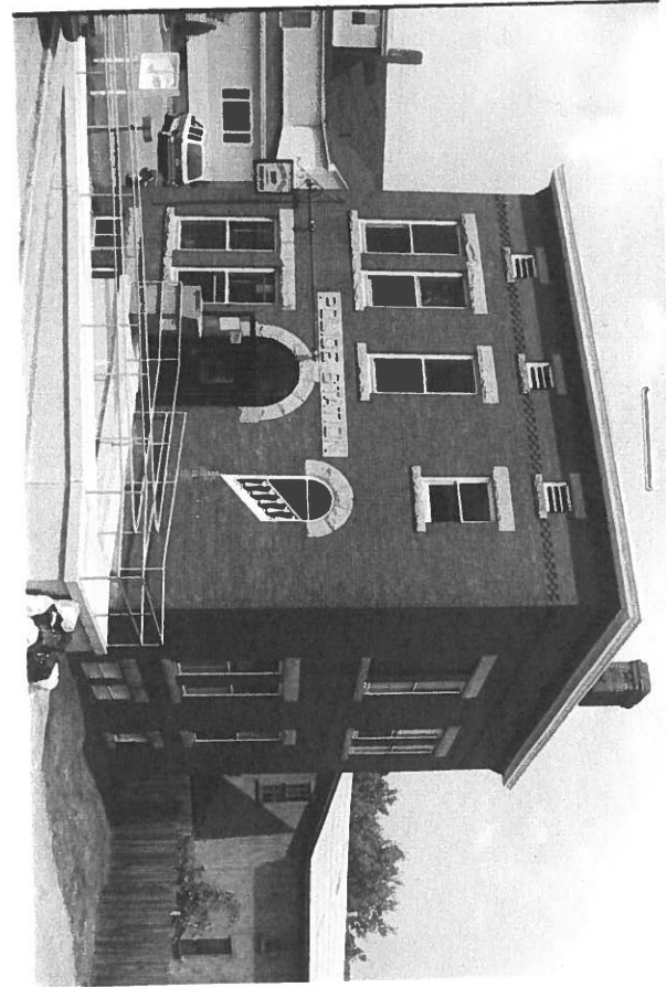
Photograph date: 6/7/90 Roll# 2 Frame # 18a