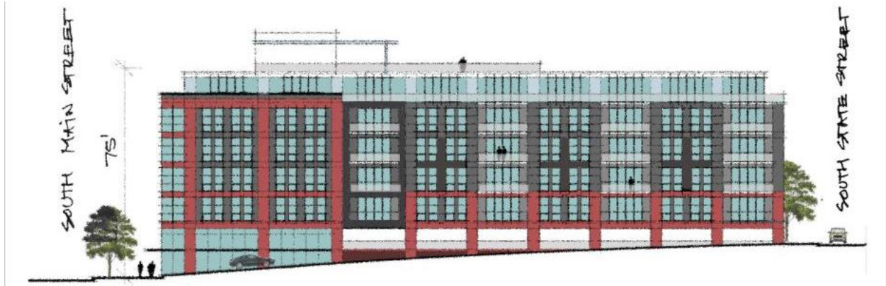
Fayette Street Elevation