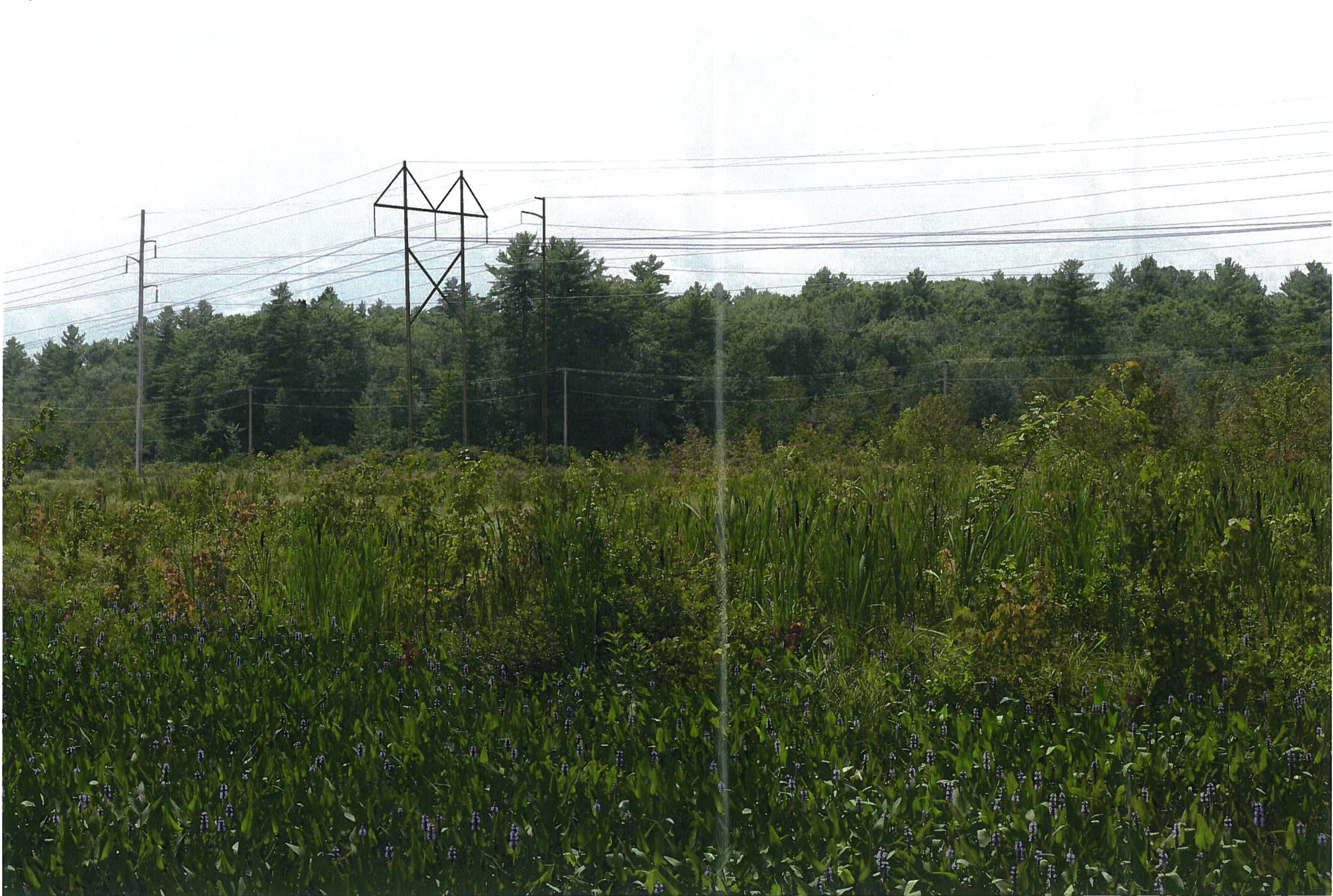
Viewing distance: 18"