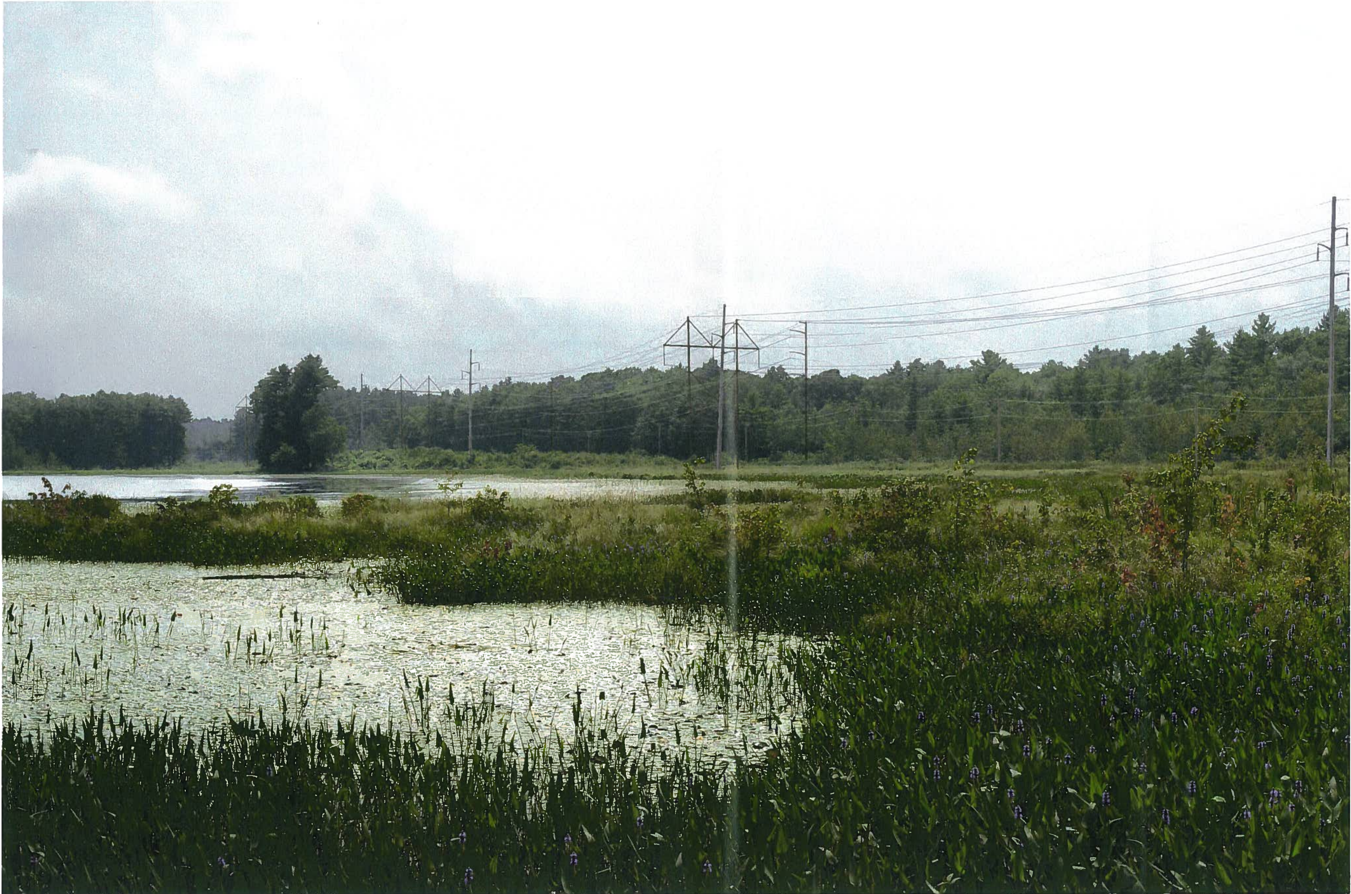
Viewing distance: 18"