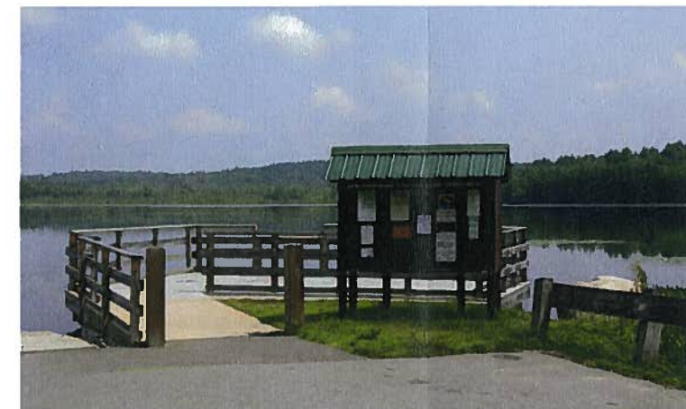
Site photos were taken from the observation deck.