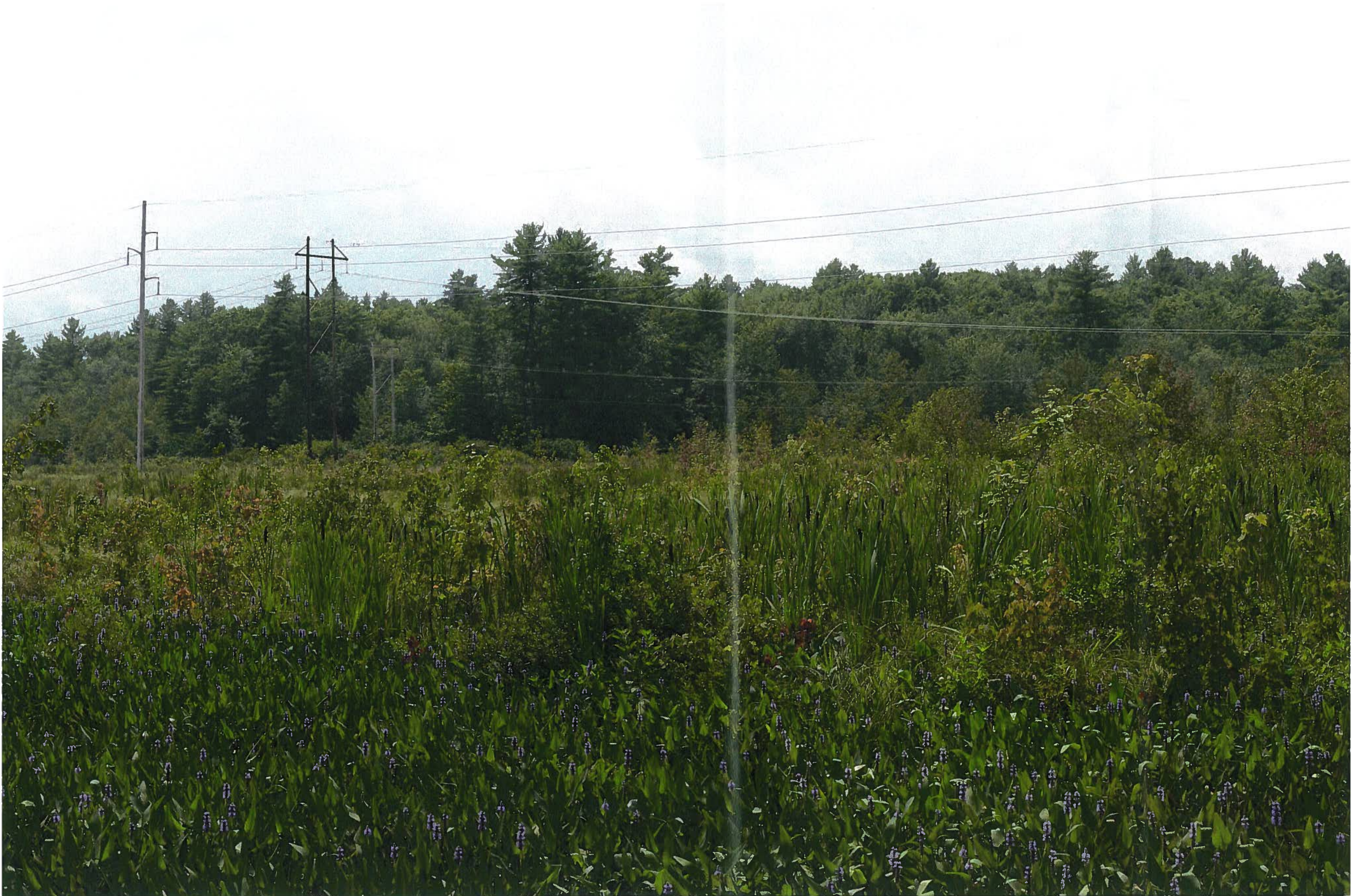
Viewing distance: 18"