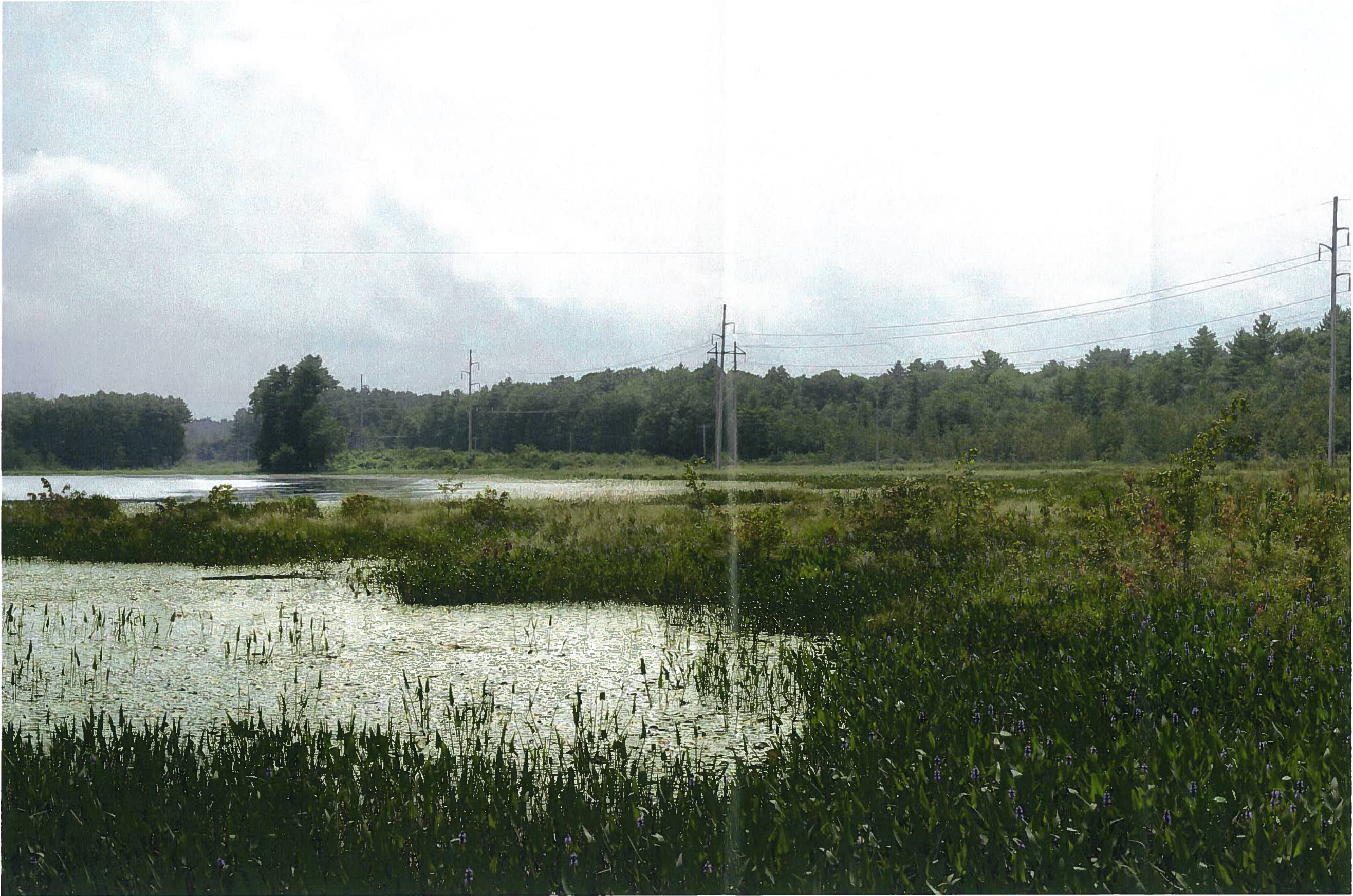
Viewing distance: 18"