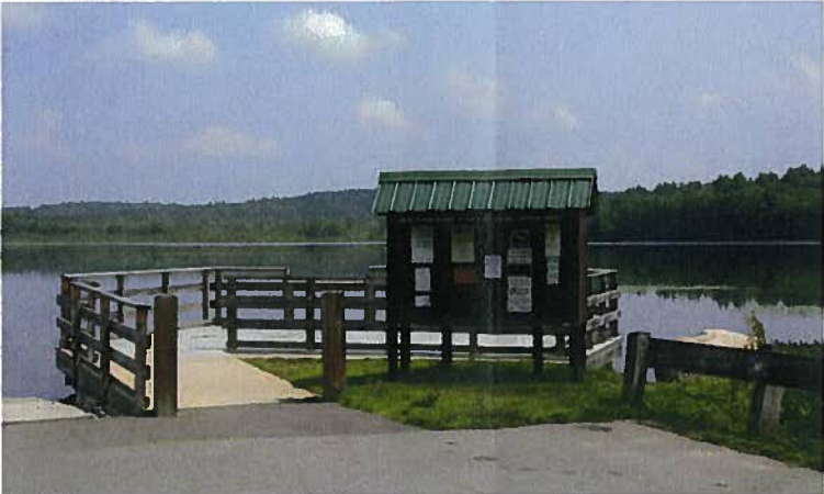
Site photos were taken from the observation deck.