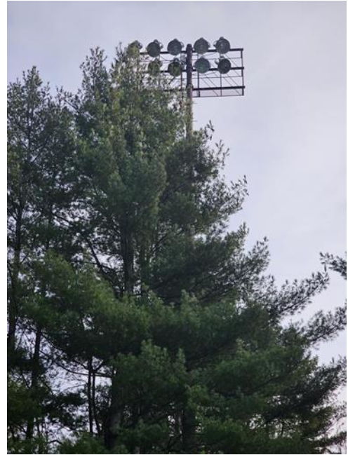
Trees along property line with Trinity Baptist Church.