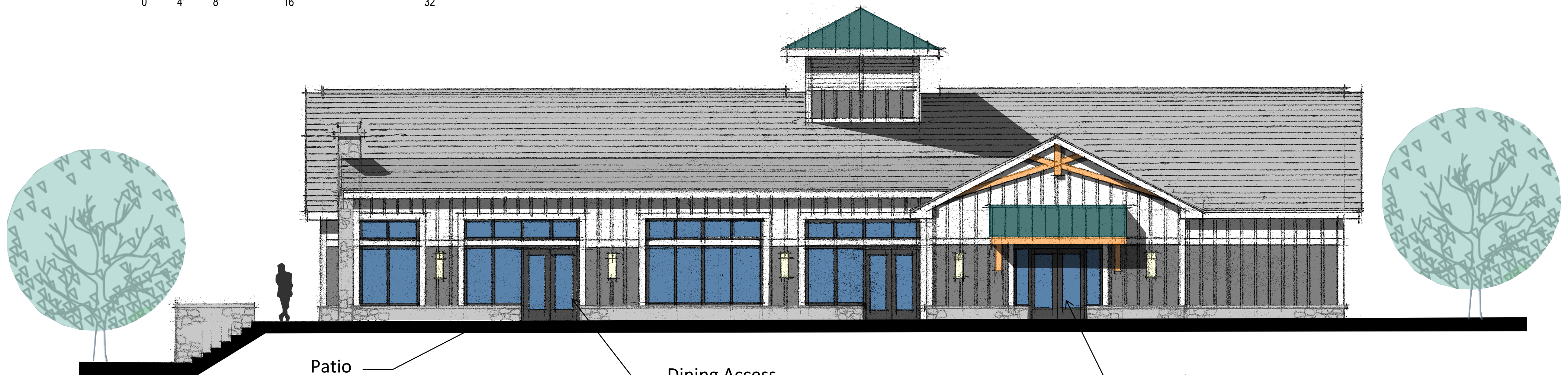
East Elevation - Patio