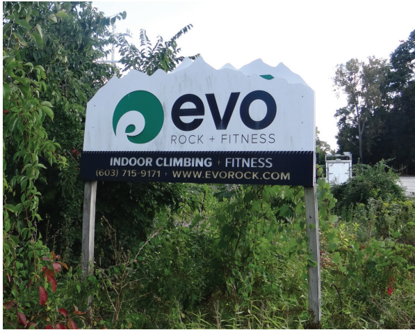
EXISTING 4X8 FOOT SIGN - DOUBLE SIDED