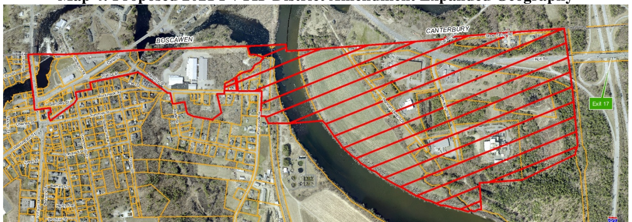
Map 4: Proposed 2021 PVTIF District Amendment Expanded Geography