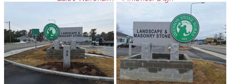
East Wareham - Finished Sign