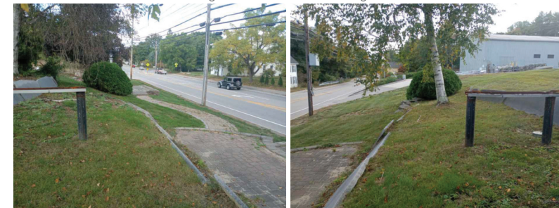
Existing Conditions / Old Sign Base