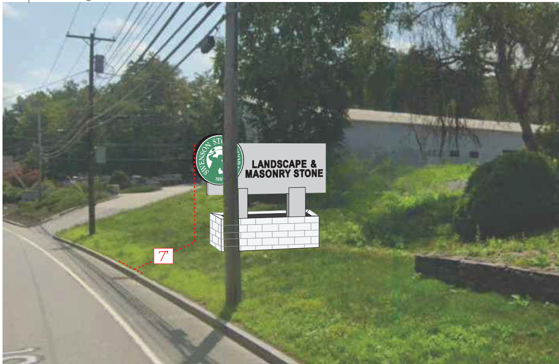
Proposed Sign Placement