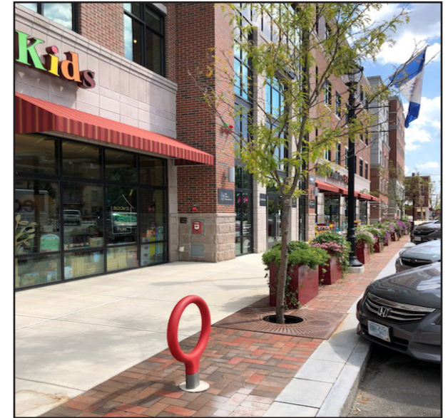
Large planters enhance the streetscape without obstructing the pedestrian pathway or other streetscape amenities.