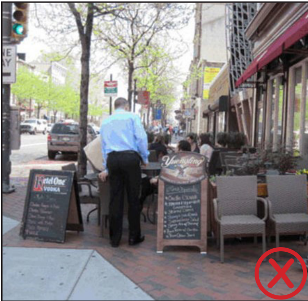
The outdoor dining area blocks the pedestrian clear zone, too many features create visual clutter, and crowding of the dining area detracts from other users.