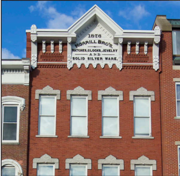
Prominently displayed building names, typically found near the cornice, can convey intriguing information about earlier occupants and uses.