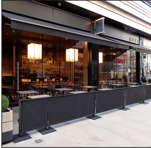
Sections are stable and consistent, keeping the pedestrian zone clear.