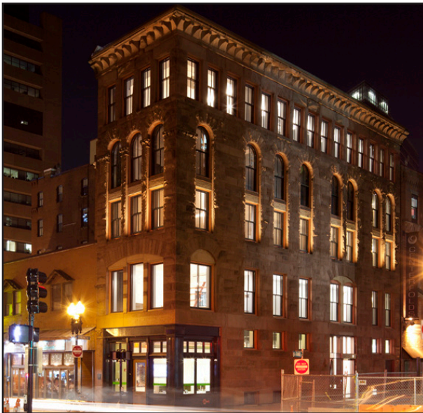
Architectural lighting emphasizes the architecture and enhances the distinctive historic character of the building.