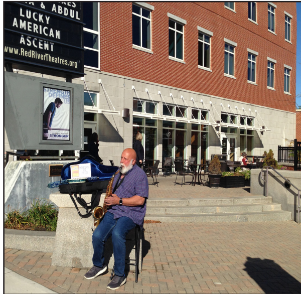
Plaza areas provide space for gathering, street performers, outdoor dining, art installations, and other amenities to enhance the public realm.