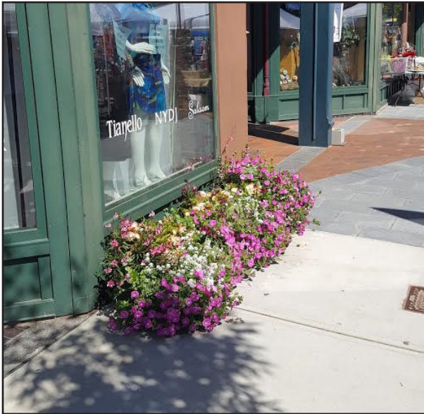
Planters are out of the way, and provide an attractive colorful feature along the streetscape.