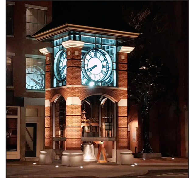
The clock tower becomes more of a sculptural element at night with lighting accents, which are also well integrated with other streetscape features.