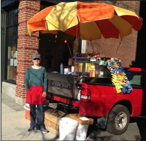
Vendors appropriately utilizing available spaces are valuable local amenities that animate the public realm.