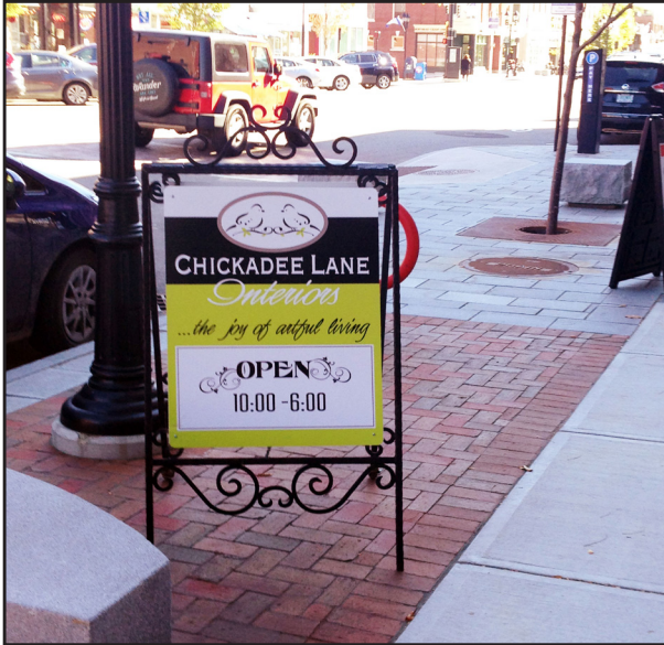
Sign is appropriately located in Zone C, leaving the pedestrian path clear and unobstructed.