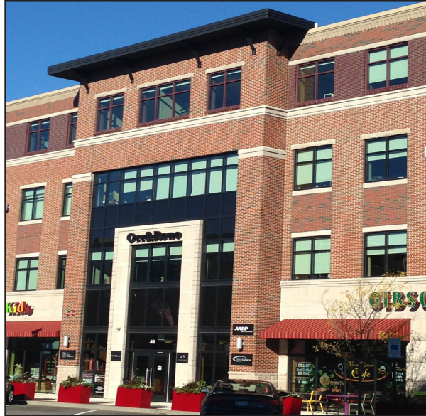
A range of colors, materials, window types, and architectural features creates an attractive building with strong lines, well integrated with the street.