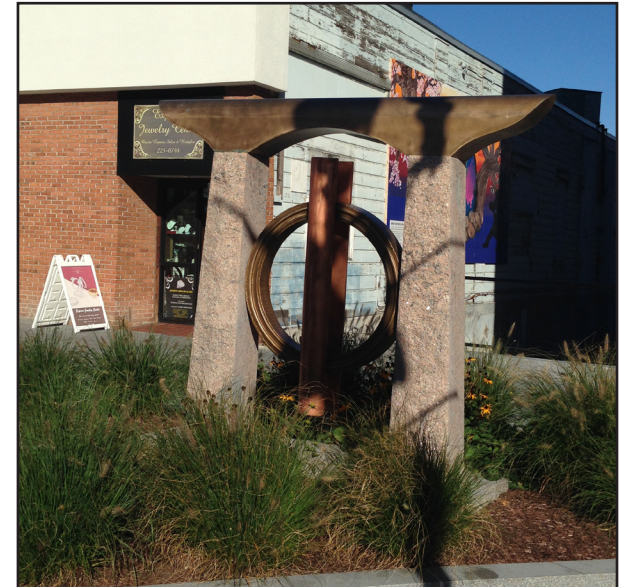
Contemporary public art can enliven the streetscape and offer year round interest.