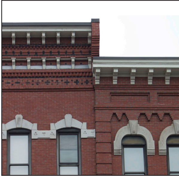
Main Street's historic buildings are richly ornamented and add texture and interest for the passer-by.