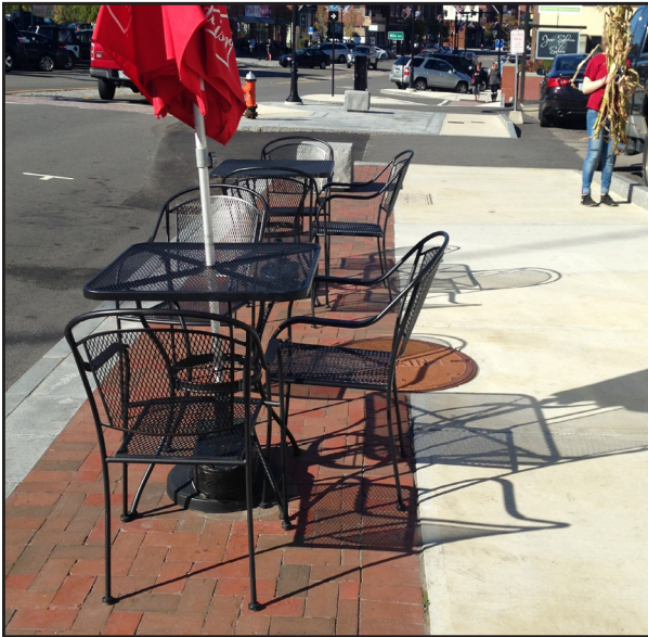
Tables and chairs located in Zone C, clear of the pedestrian clear zone and public amenities.