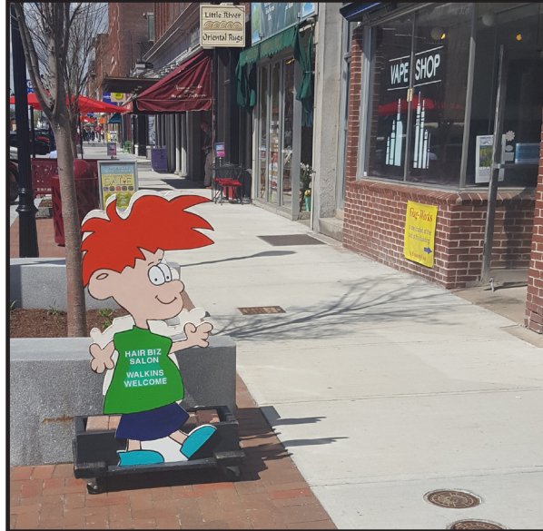
Playful and colorful sign is located correctly, out of the pedestrian clear path