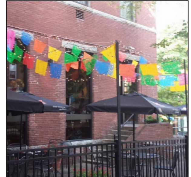
The outdoor dining area is enhanced by attractive fencing, well maintained umbrellas, and features with color and interest added tastefully.