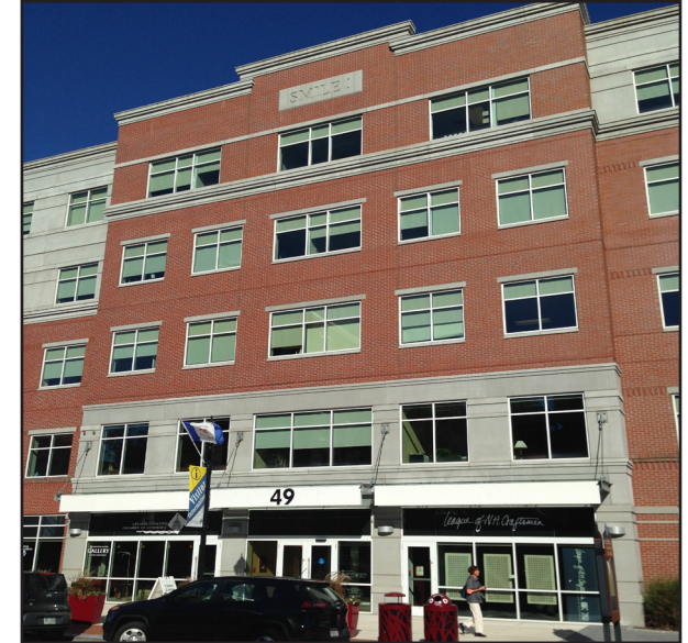
Buildings consisting primarily of offices can still maintain an activated streetscape presence with windows, storefronts, and architectural features.