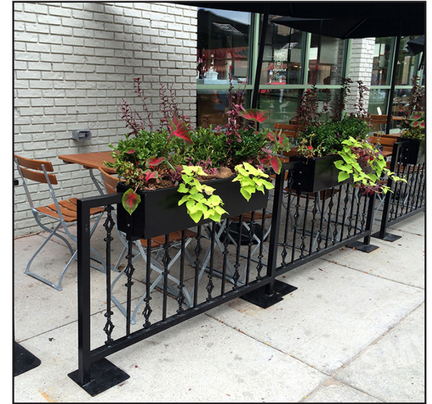
Enclosure utilizes quality materials, creates a sense of privacy with planters, has substantial base plates for stability, and takes up minimal space.