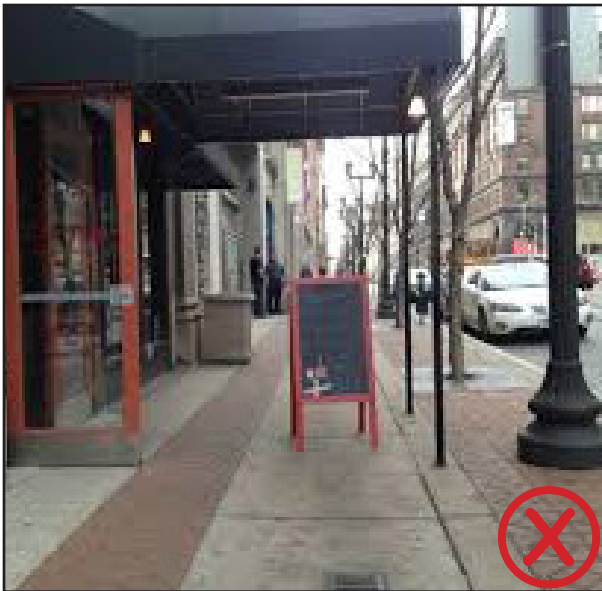
Sign is placed in the middle of the pedestrian clear zone, blocking free movement and creating an uncomfortable pedestrian space.