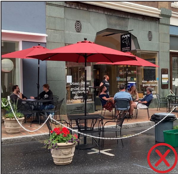
Planters and rods used as stanchions; chain link used; trash receptacles along the barrier; location creates safety concerns without a more substantial barrier.