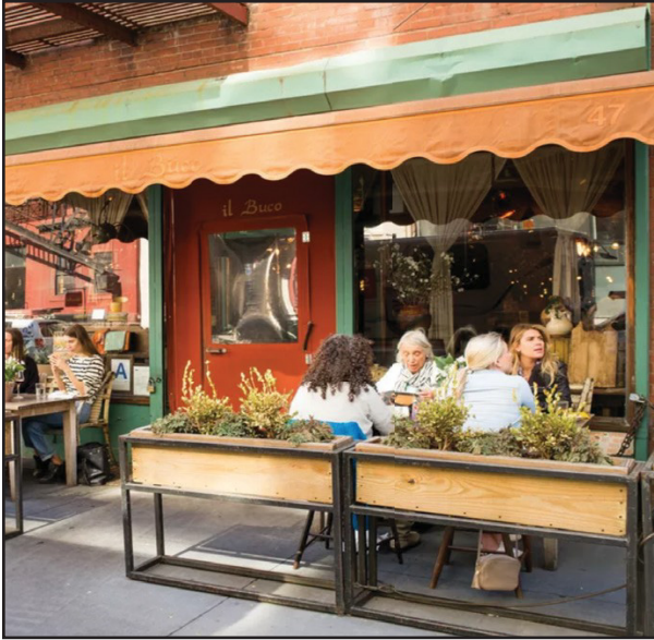
Wood and metal combined with vegetated planters creates an attractive barrier.