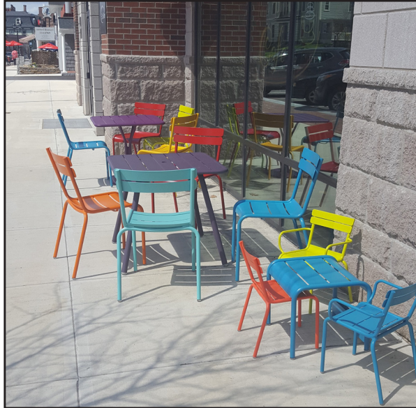
Bright colors provide visual interest and a playful character; seating is also provided for children.