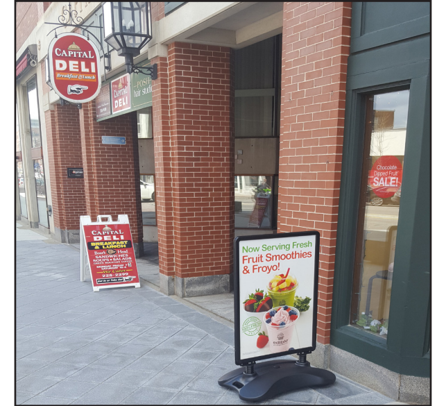
Signs are placed tight against the building keeping the pedestrian zone clear, even though there is no clearly defined boundary indicated by the paving or Zone A.