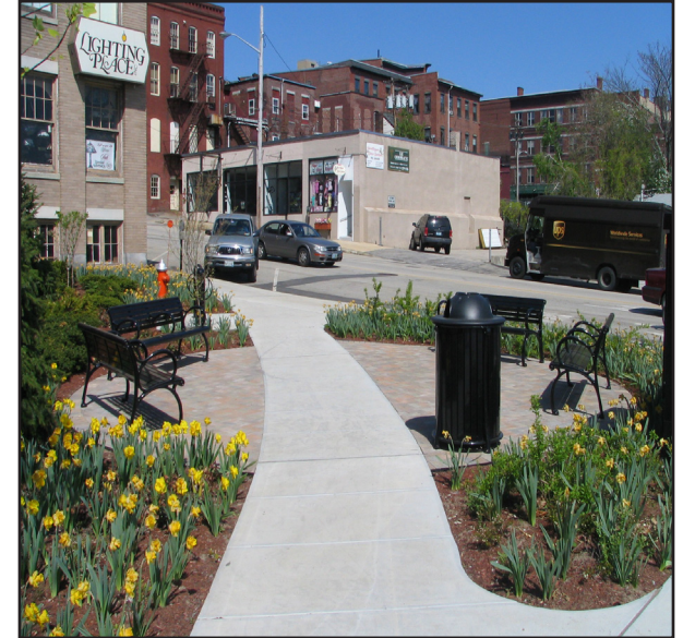
Small landscaped spaces are valuable amenities that provide a welcome change for seating and gathering areas.