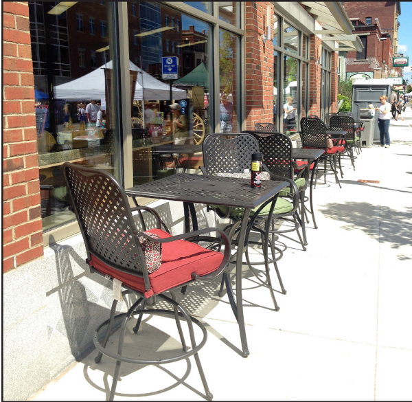
Outdoor dining is arranged to allow a linear 5 foot wide pedestrian clear zone and provides attractive, quality amenities.