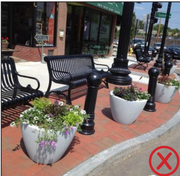
Planters are blocking access to the public benches and impeding circulation around them. They are also creating an awkward space that is unlikely to be used.