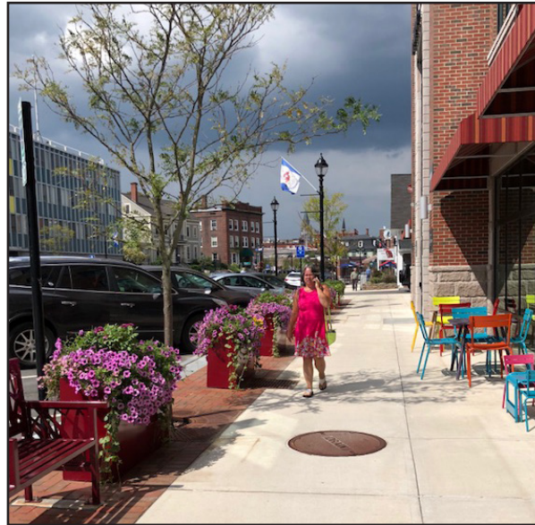
Planters appropriately placed in Zone C without hindering access to the public bench.