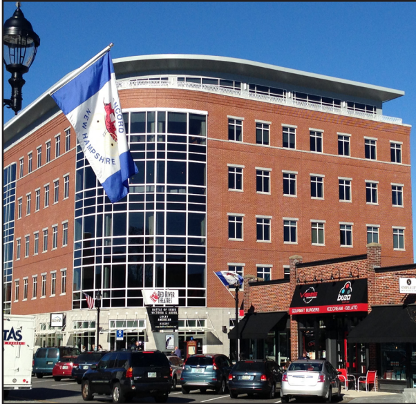
New buildings can reference existing architectural styles while still having a modern character.