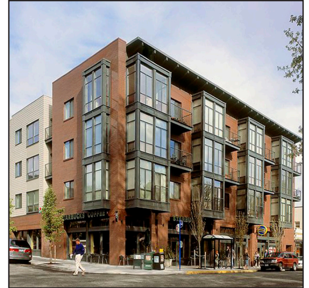
Balconies are recessed on a newer brick building with metal and glass architectural features that blend well with the balconies and are not within the right of way.