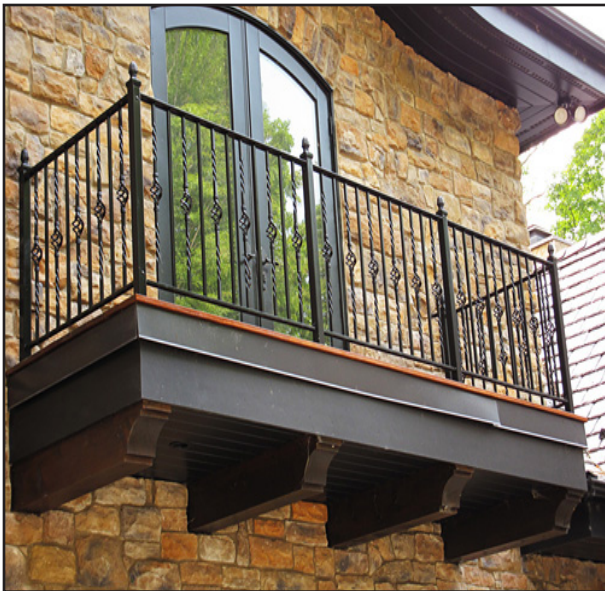
This retrofit balcony presents an attractive treatment of the underside.