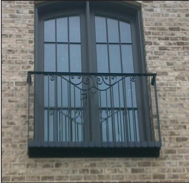
Elegantly designed Juliet balconies can provide private amenities without encroaching into the right of way.