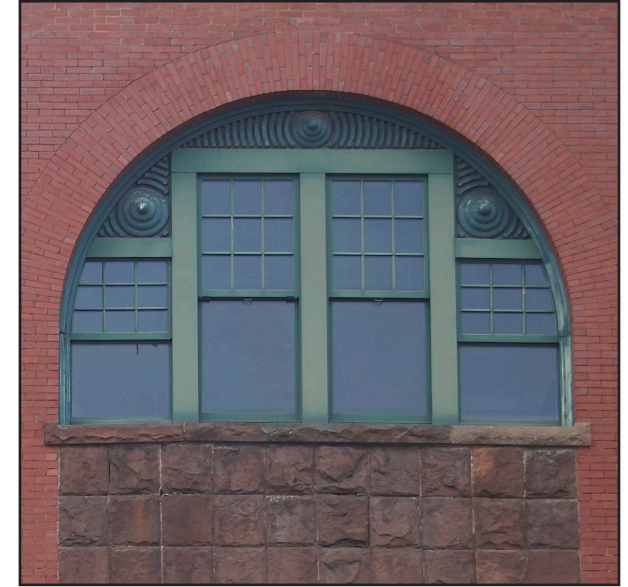
These replacement windows reflect the Queen Anne architectural style of the Chase Block.

Downtown Concord, which is listed on the National Register of Historic Places, has one of the best assemblages of 19th and early 20th century commercial, civic and institutional buildings in New England. Despite near uniformity in height and material, each building is individually and distinctively detailed. Beyond delighting us visually, their architectural features convey the history of downtown, as well as reflect wider trends and events.