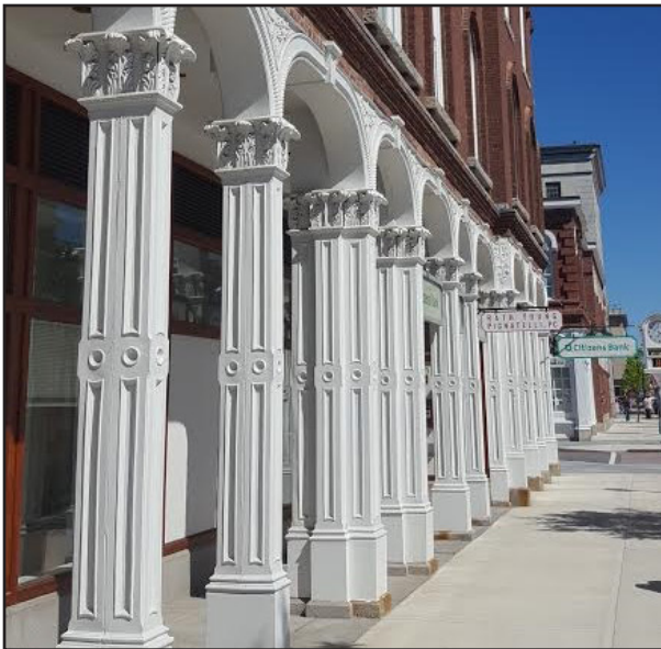
Architectural features, such as this iron storefront arcade, add character and a unique sense of identity to the streetscape.