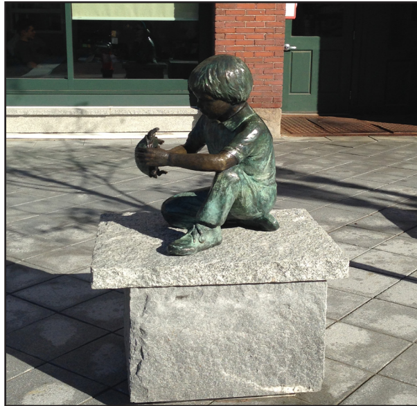
Classic stone and bronze sculpture provides visual interest and a historic character.