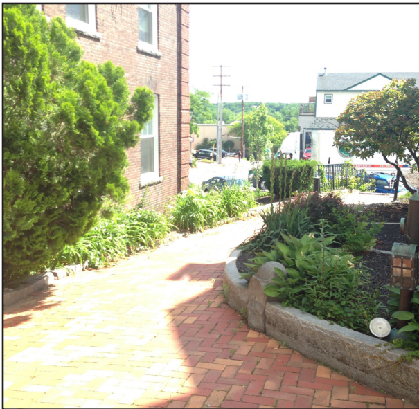
Attractively landscaped area with paved walkway is an inviting, semi private intimate space to rest, have lunch, or meet.