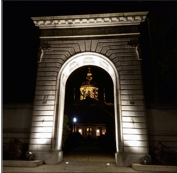
Lighting can highlight classic design relationships and create dramatic and inspiring spaces.