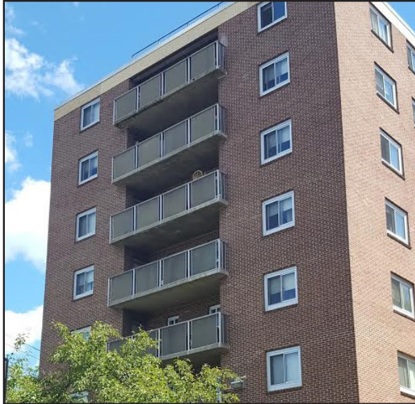
These inset balconies were part of the building's original design. Furthermore, they do not overhang the public right-of-way.