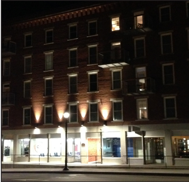
Subtle and correctly positioned lighting on buildings can highlight architectural features and enhance the building facade.