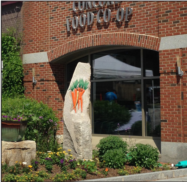
Landscape bed on private property provides space for a playful stone sculpture and seasonal installations.