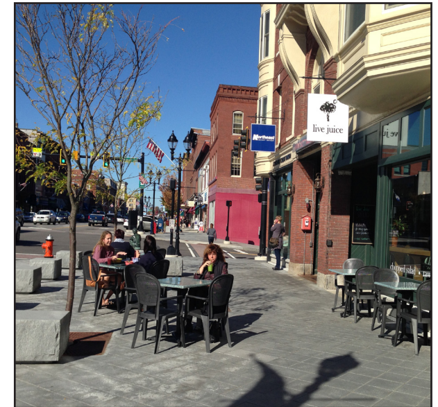
Although Zones are not clearly delineated with paving patterns, dining areas are arranged to avoid encroaching on the pedestrian clear zone or public seating areas.