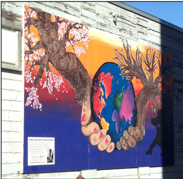
Colorful murals can enliven an otherwise unattractive or homogeneous facade, breaking up large expanses of uniform shapes or materials.