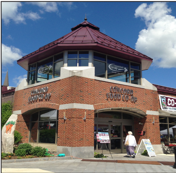
Different or modern architectural styles can be compatible with the community character and create a sense of vitality.