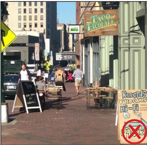
Pedestrians must walk around the dining area; the pedestrian zone is blocked with a chain, while the alternate route is also blocked with a sandwich board.