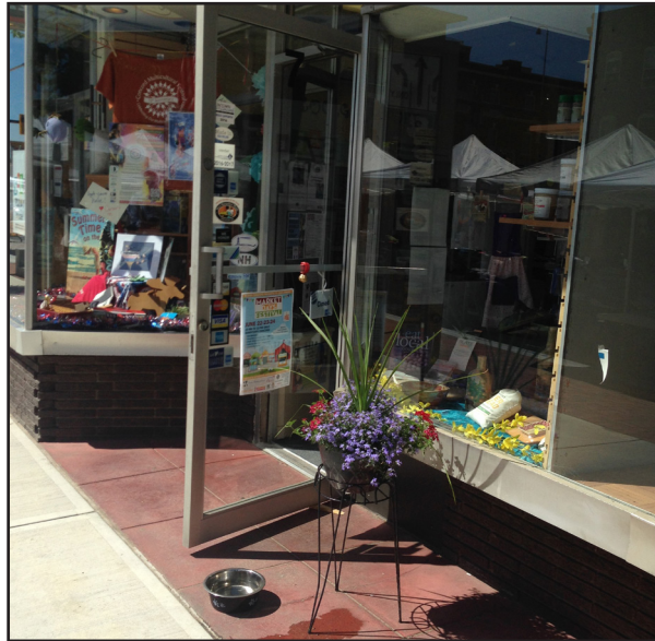
Planter is located in the recessed portion of the frontage, out of the way of the pedestrian pathway, and enhances the store entrance.