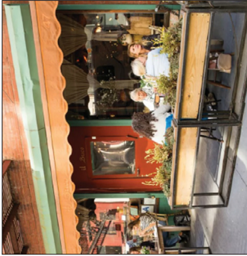
Wood and metal combined with vegetated planters creates an attractive barrier.