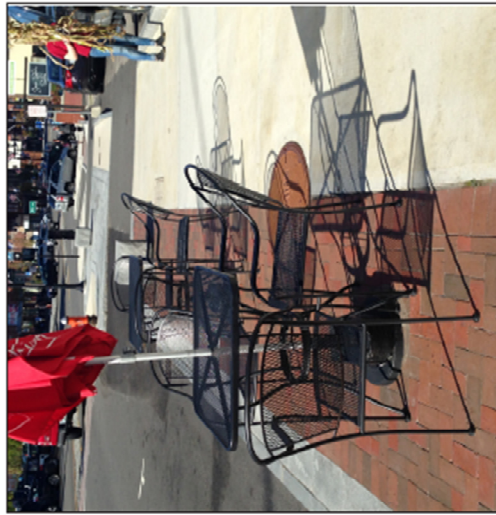
Tables and chairs located in Zone C, clear of the pedestrian clear zone and public amenities.