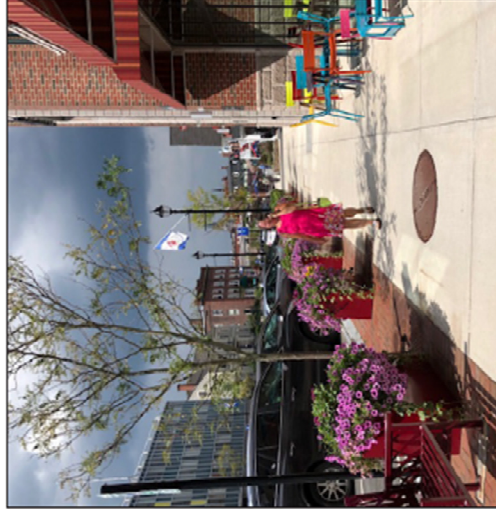
Planters appropriately placed in Zone C without hindering access to the public bench.