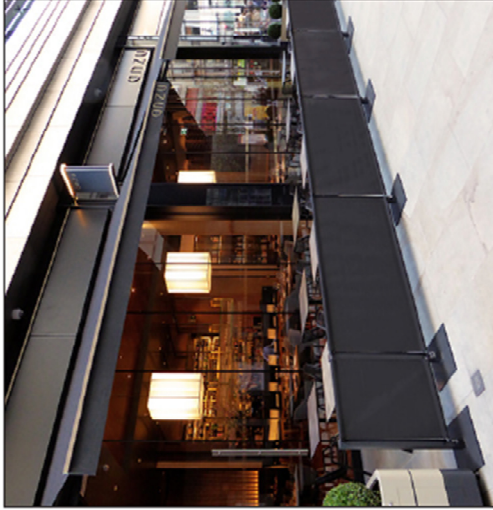
Sections are stable and consistent, keeping the pedestrian zone clear.