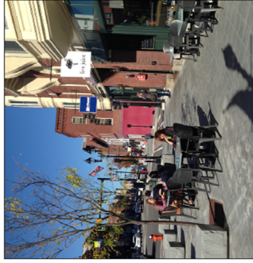
Although Zones are not clearly delineated with paving patterns, dining areas are arranged to avoid encroaching on the pedestrian clear zone or public seating areas.