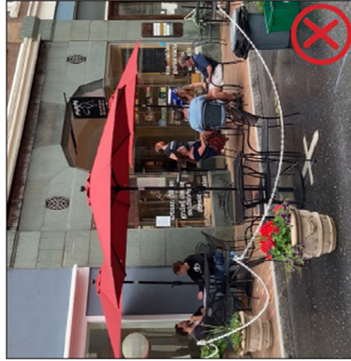
Planters and rods used as stanchions; chain link used; trash receptacles along the barrier; location creates safety concerns without a more substantial barrier.