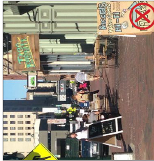
Pedestrians must walk around the dining area; the pedestrian zone is blocked with a chain, while the alternate route is also blocked with a sandwich board.