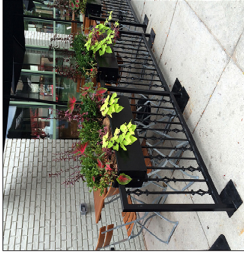
Enclosure utilizes quality materials, creates a sense of privacy with planters, has substantial base plates for stability, and takes up minimal space.