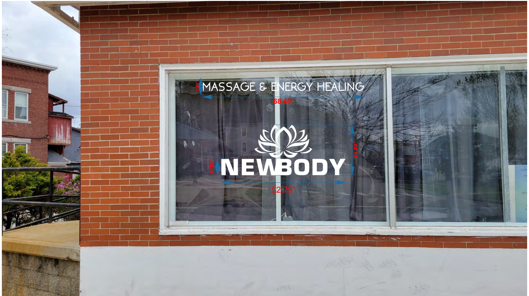
White Cut Vinyl Applied directly to window