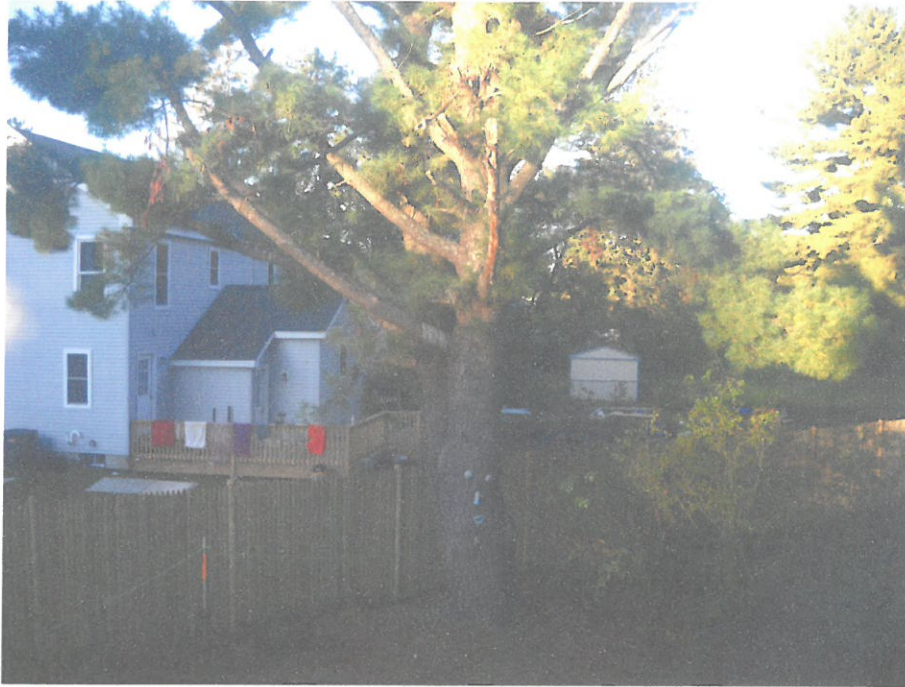
Day after the event ended- a.m. we noticed heaps of black trash bags in center of back yard.