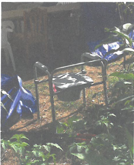
OPEN COMMODE IN YARD BY DINING TABLE