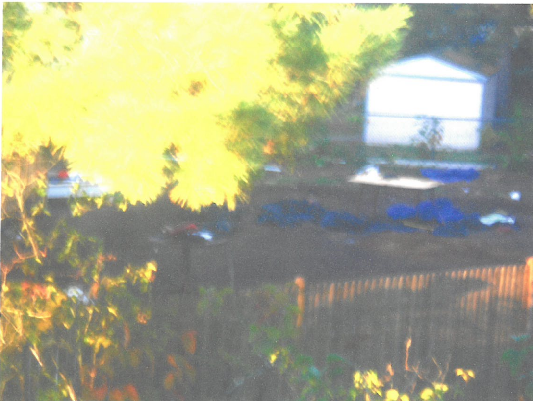
10/7/2015 in the morning. Look what now has become of the trash... it looks like they buried it- because you can see the soil is different colors and has bumps and lumps.