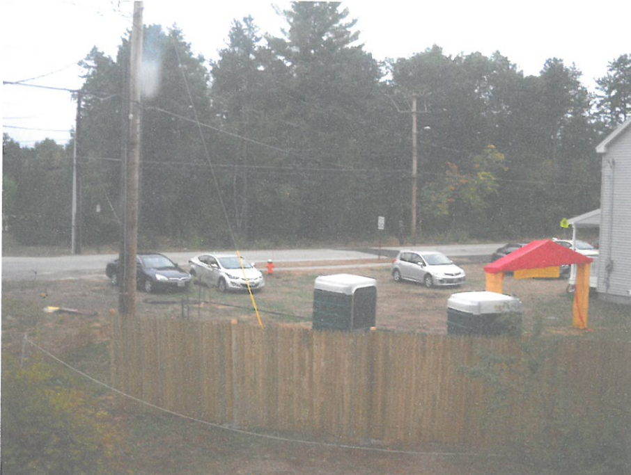
VIOLATION: Emptying fluid into a city storm drain- The neighbors were witnessed running a pumping station and this long black hose after heavy rains into the corner city drain.