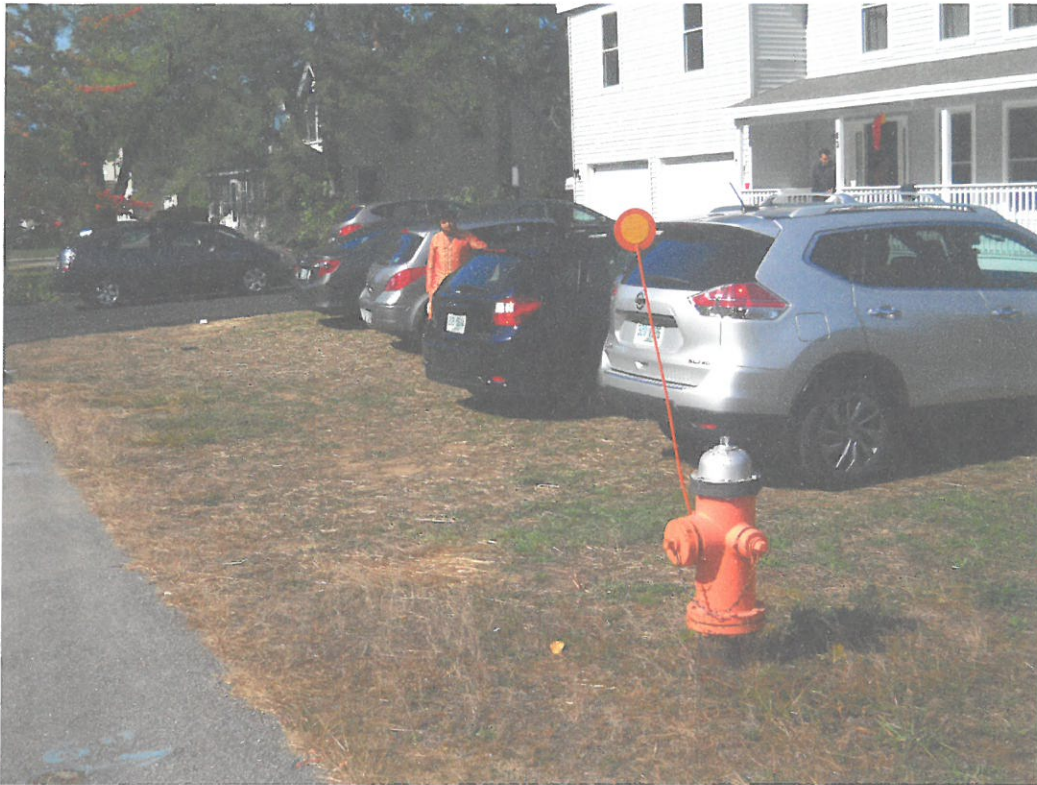
VIOLATION: Cars during the 9 days parked and blocked fire hydrant, blocked sidewalks, parked on both sides of street and several times on curve. Fire hydrant- 15 ft ordinance.