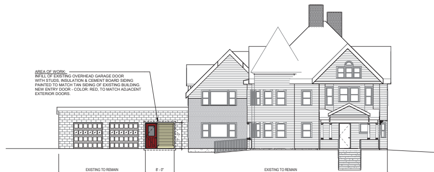
2 EAST ELEVATION 1/8" = 1'-0"