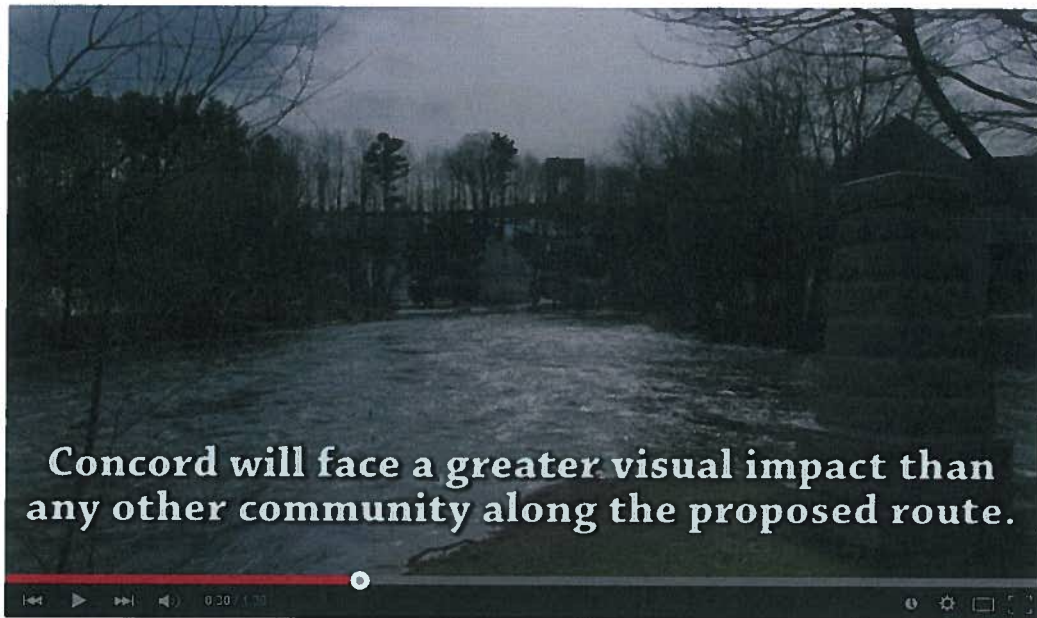
Image from video