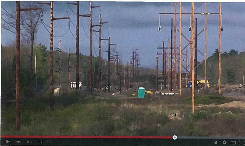
Image from video shows unknown transmission corridor not affiliated with Northern Pass (structure design or location)

The video also includes images of questionable origin, including at the 1:04-mark. While we cannot definitively say where this shot was taken, we do know this is not a right-of-way in New Hampshire.