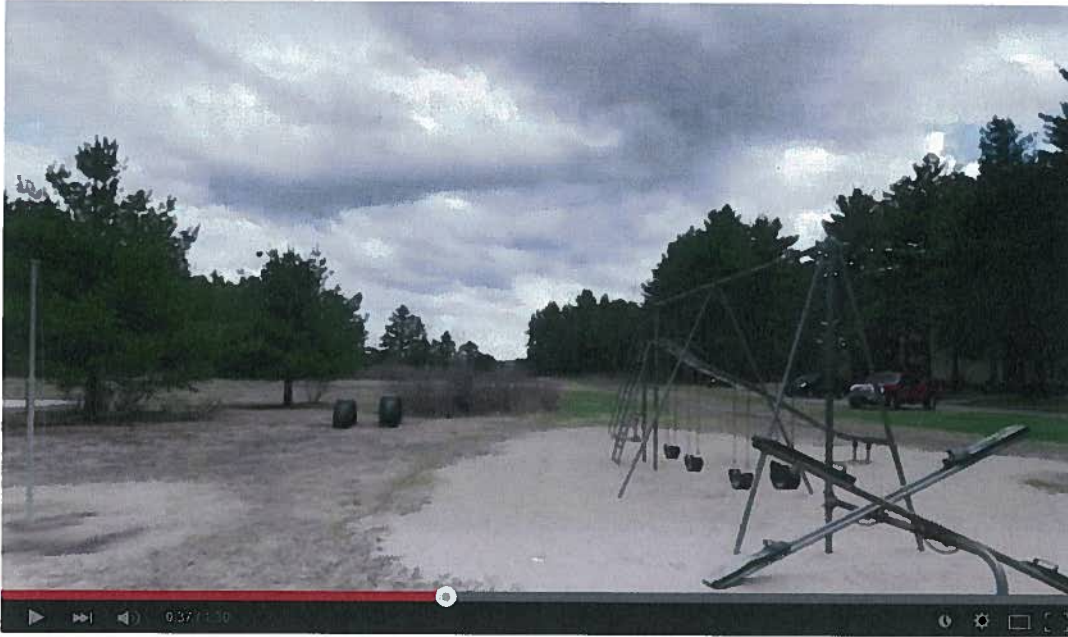
Image from video misleads viewer by digitally removing power lines that exist today

The scene that is apparently most intended to shock viewers also happens to be the most blatantly inaccurate. At the 42-second mark, we see a string of structures pop up around a small playground.