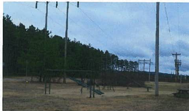
Actual current photo of playground and existing transmission corridor in same location

Last week, a Maine-based company called Conservation Media Group released a blatantly misleading video that uses heavily doctored images in an attempt to pressure Concord city officials into opposing the project. The video does not identify who is paying for the spot. The partners in this deceptive video are only revealed by clicking on a link and scrolling to the bottom of a separate page. These partners include the Society for the Protection of New Hampshire Forests and the Appalachian Mountain Club.