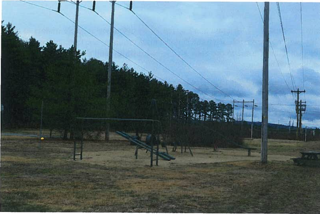
Actual photo of playground and existing transmission corridor