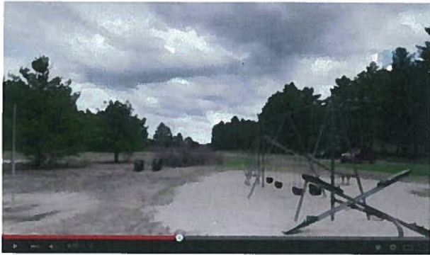
Image from video produced by Northern Pass opposition group