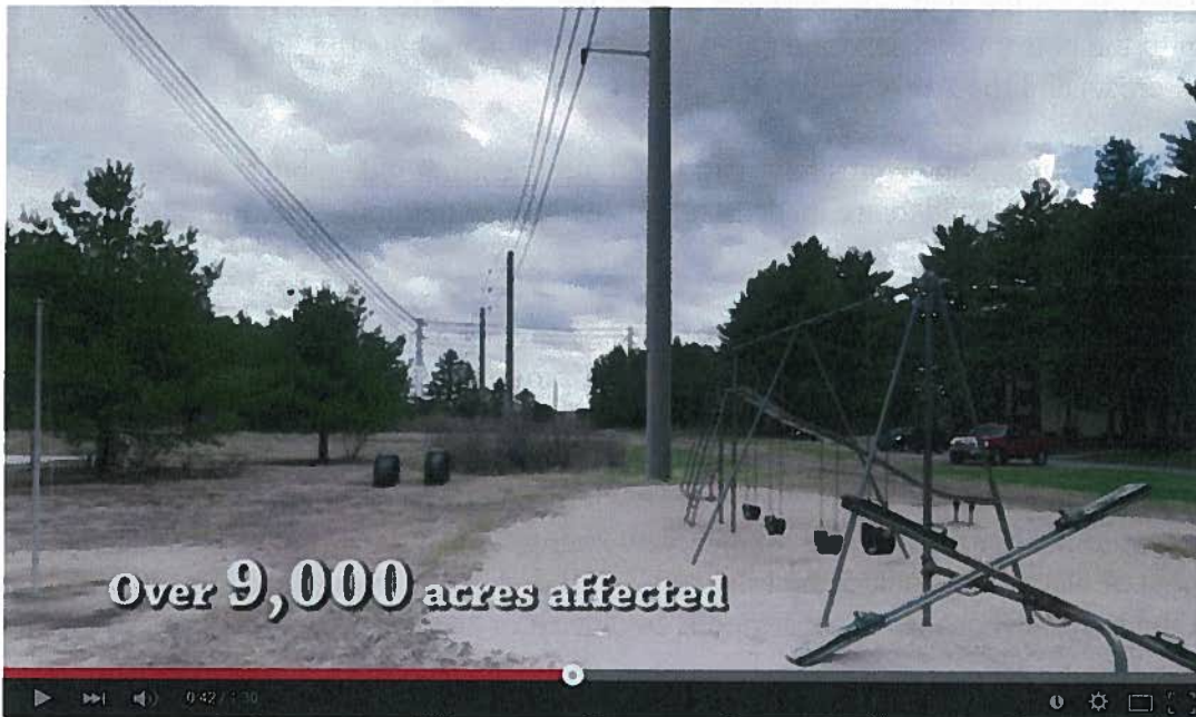
Image from video gives viewer the false impression that Northern Pass structures will be built in an area where power lines do not exist today

Image from video misleads viewer by digitally removing power lines that exist today