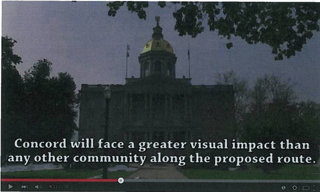
Image from video

The New Hampshire State House is shown at the 33-second mark as the video discusses possible impact to the city, however, the Northern Pass line will not be visible from the state Capitol grounds, nor from any portion of the downtown area. The closest the project will come to the State House is 2.3 miles, and that section of the project is within a commercially developed area.