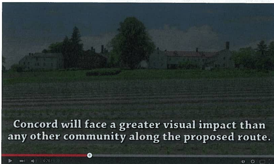
Image from video

At both the 28 and 30-second marks of the video, the viewer is given the impression that the Northern Pass line will be visible from the Canterbury Shaker Village and the Tilton Arch in Northfield. Neither location is in Concord, as the text implies, and neither location will have a view of the Northern Pass line.