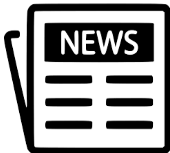
CITY MANAGER'S NEWSLETTER

Launched in January 2019 as a place where we can tell Concord's story & house our own City news. More posts coming soon!