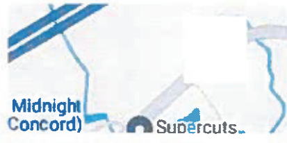
Image capture: Oct 2023