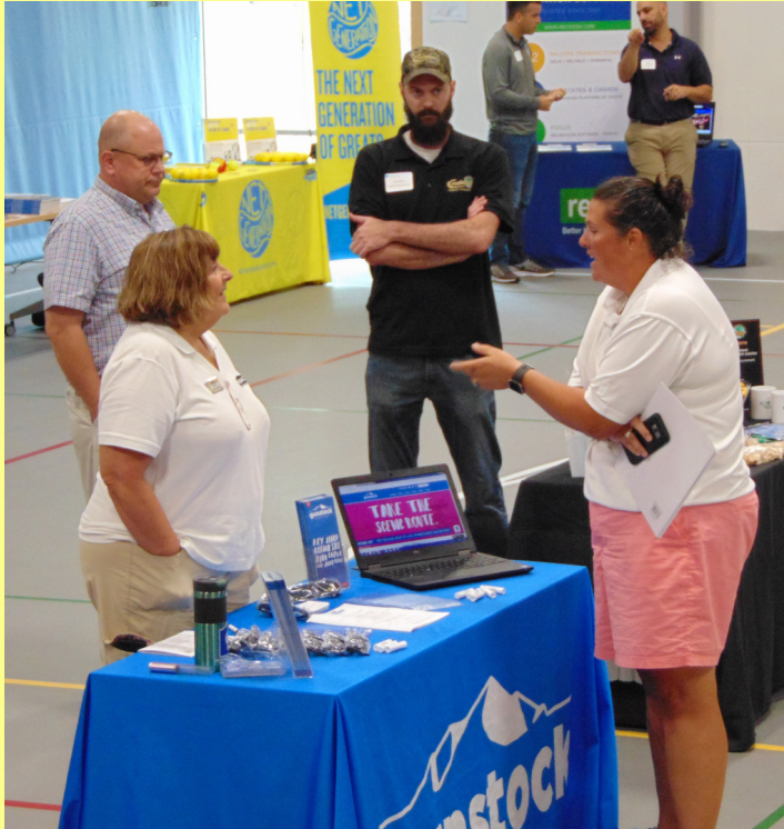
NH Parks & Recreation State Conference

The City Wide Community Center and the Green Street Community Center gym remained open throughout the year for in person programming and rentals. Though the West Street Ward House and the City Auditorium (Audi) were closed in the early part of 2021, we were able to open all locations including the Merrimack Lodge at White Park for limited use. All our regular programs and classes were offered with reduced capacity, and extra time built into the schedule for extra cleaning and separation of participants.