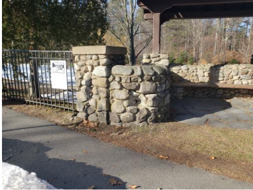
Trolley Stop at White Park

CIP51: White Park. The Trolley Stop needs to be repaired and repointed to keep the structure standing for years to come. Estimated cost of repairs is $70,000. This was listed as a FY24 project.