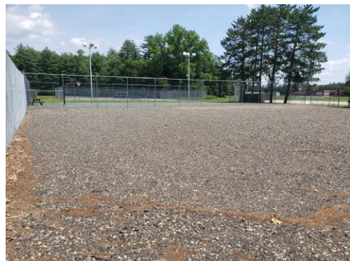
Rolfe Park Old Tennis Court Area. Park still has 2 tennis courts.

CIP55: Rolfe Park. Add standalone pickleball courts at the location of the former two tennis courts. There area is already fenced and has a good base. Cost to repave surface, add pickleball courts and upgrade existing lighting to LED is $85,000. This was listed as a FY24 project.