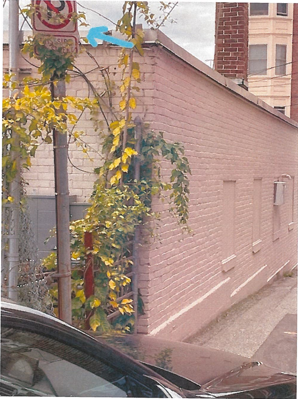
Kennedy Lane – No Parking Sign