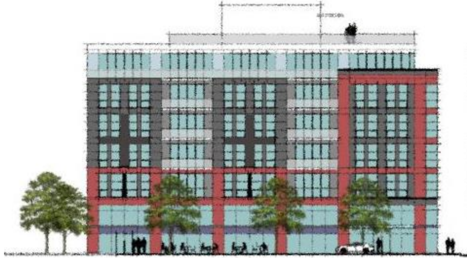
South Main Street Elevation

Preliminary designs for the developer's project are as follows. It is important to note that these are very preliminary and subject to change as the design and development permitting process moves forward.