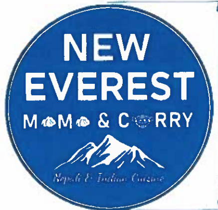
Double Sided .5" PVC