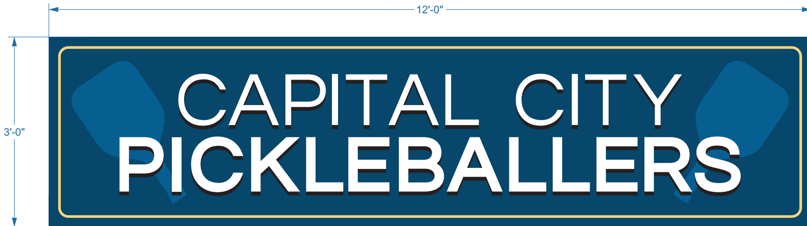
Business identification sign