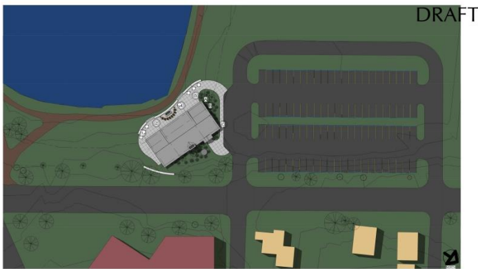
SKATE HOUSE / MULTI-USE BUILDING WHITE PARK CONCORD, NEW HAMPSHIRE OPTION 4B - SITE LAYOUT SCALE: 1" = 40'-0" DATE: 02.01.13 TURNER GROUP